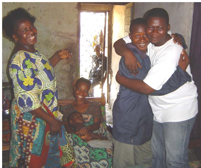
Young boy and his family reunited by IRC's Family Tracing Program in DR Congo.

Currently, 20 million children and adolescents are uprooted from their homes, either as refugees or internally displaced persons.