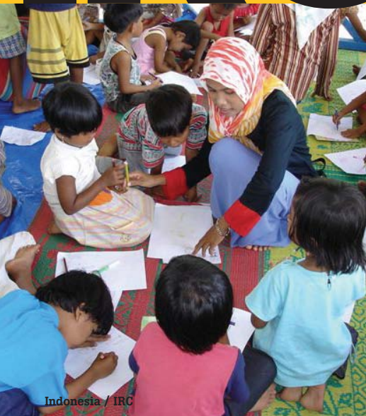
Indonesia / IRC

IRC responds by protecting young people and meeting their developmental needs during wartime and through post-conflict reconstruction. IRC: