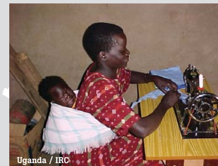
Uganda / IRC

3 In northern Uganda , at least 20,000 children have been abducted by the rebel group the LRA during a ruthless 18 year civil war. Thousands have managed to escape. When found, the children are usually in a state of shock and in need of immediate medical and psychological attention. They also need to find and rejoin their families and begin the slow process of healing, recovery and community reintegration.