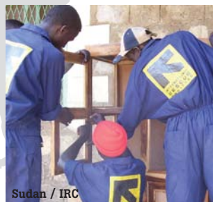
Sudan / IRC

2 After more than 20 years of civil war, South Sudan is left with a hugely inadequate workforce. As a result, massive investment in literacy and vocational skills will be required for the successful reintegration and reconstruction of the country. In Juba, South Sudan, the IRC is intervening to address these challenges by supporting formal vocational skills training for vulnerable youth as well as offering literacy and business skills classes in six different IDP camps. Youth that have been selected to participate in a carpentry skills program are hopeful that the training they receive will help them find lucrative work opportunities in the future.