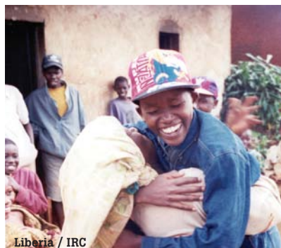
Liberia / IRC

1 IRC has successfully reunited 4,500 separated Sierra Leonean and Liberian children with their parents or other family members. Over a period of 12 years of civil wars in their countries, the children had crossed the border to the relative safety of Guinea where IRC identified, registered and supported them in foster families while tracing their families.