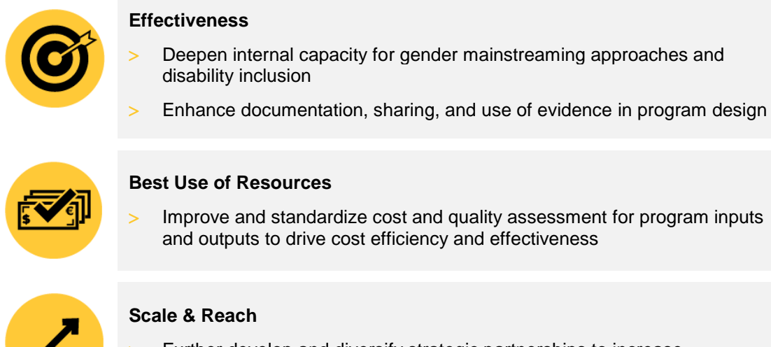
Figure 2: Commitments to Ensure Impact

Further develop and diversify strategic partnerships to increase programmatic reach