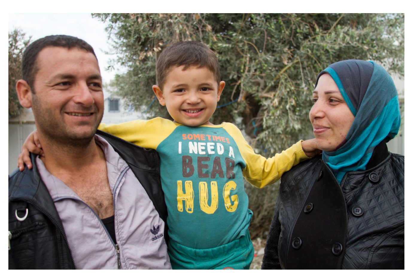
Above: A family seeking protection in Greece.