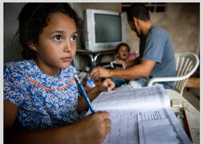
A child works on a puzzle at the IRC's care center in Cúcuta while her mother meets with IRC staff. In a few months she will start school.

Despite initial challenges, the influx of Venezuelans could improve Colombia's economy over the long-term. The majority (over 70 percent) of Venezuelans arriving are working age and the World Bank estimates Colombia's economy could grow by 0.2 percent for every half a million people of working age. But these benefits are contingent on the integration of Venezuelans into the labor force. Currently, the Venezuelan population is twice as likely to be unemployed as the local population and 93 percent with jobs work in the informal sector. Among Venezuelans, 78 percent identified a job as their greatest need and the IRC's assessment of Venezuelans in Colombia in November 2018 found that their top six reported needs could be met with access to an income or regular cash.