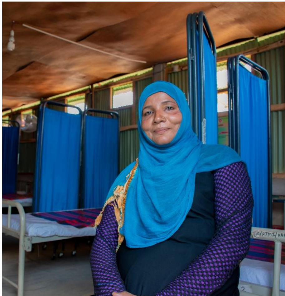
Photo: Senwara is a volunteer at the IRC supported comprehensive women's centre. (Jessica Wanless/IRC)

Host and refugee inter-community risks: Examples of host and refugee inter-community risks include sexual violence and harassment, theft, conflict over resources, the illicit drug trade, perceptions of 'otherness', and general violence.