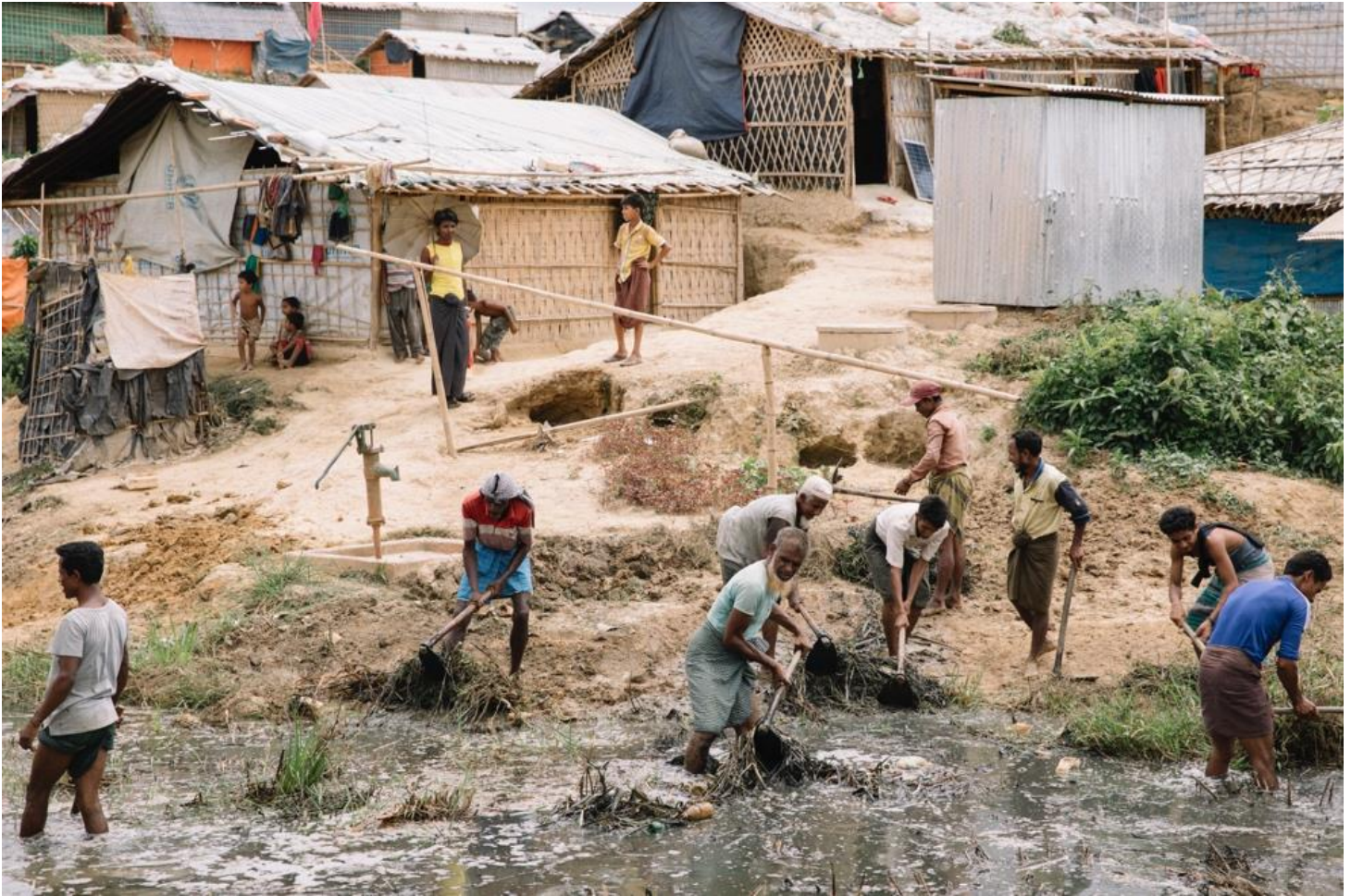
Refugee men work to clear a water channel in Kutupalong Refugee Camp in preparation for monsoon rains.

interventions have the further potential to strengthen local legal systems and positively contribute to greater social cohesion between refugee and host communities 4 laying the groundwork for long-term regional stability and safe refugee returns.