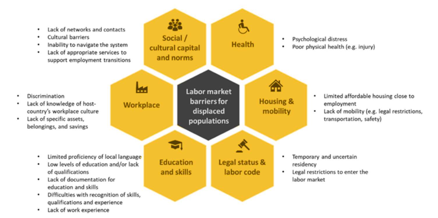
Figure 1: Typical barriers to labor market integration for displaced populations

According to the literature, there are six main categories of labor market barriers for displaced populations overall (see Figure 1 below). These include macro level barriers, such as legal frameworks, as well as other factors such as skills gaps and limited mobility.