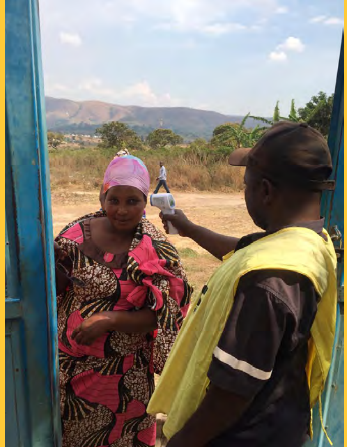
An IRC staffer takes the temperature of a women before entering a Hope Centre in Burundi. IRC