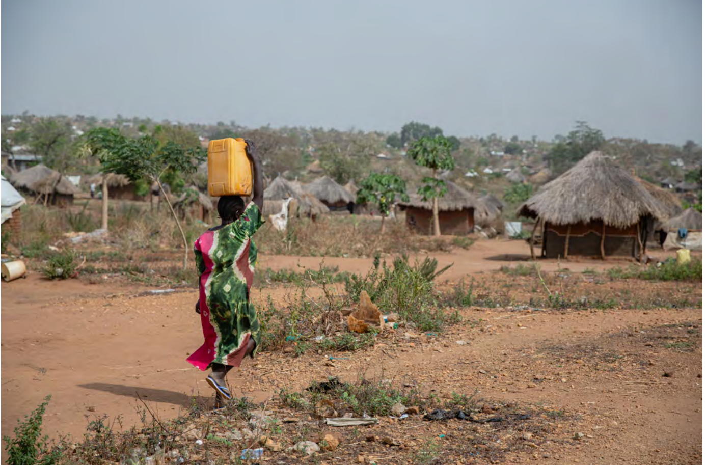
A woman carries a jerrican after collecting water at a water collection point in Bidibidi camp, Uganda.