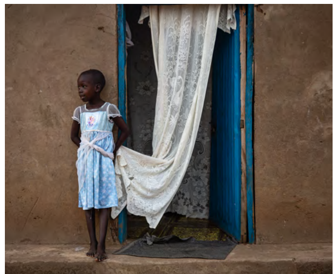
A girl is standing outside her family's house in Bidibidi camp, Uganda.

"The days gone by if we couldn't find the social worker we had to wait for her the other day but for the moment we talk by phone and that helps us a lot and there are many people who give us good reports concerning this service." (Female respondent, Burundi Safety Audit)