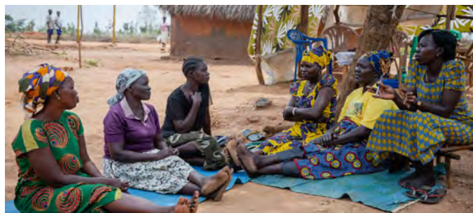
Members of the Togoleta women's group counsel a woman from Bidibidi camp, who is seeking their advice in a difficult situation.

According to key informants, there was a delayed recognition, particularly within public health teams on the ground, of the impact of COVID-19 on women and children, particularly girls, including in terms of caring and hygiene responsibilities, sexual and reproductive health, and GBV. This partial or delayed acknowledgment resulted in early public health interventions that did not prioritise providing PPE specifically designed for female health staff, nor appropriate menstrual hygiene management supplies, nor the ongoing provision of abortion care and other essential sexual and reproductive health services. Public health strategies also relied, in some humanitarian contexts, on the repurposing of women and girls' safe spaces as COVID-19 isolation or treatment centres, without any alternative arrangements put in place to ensure continuity of lifesaving GBV services.