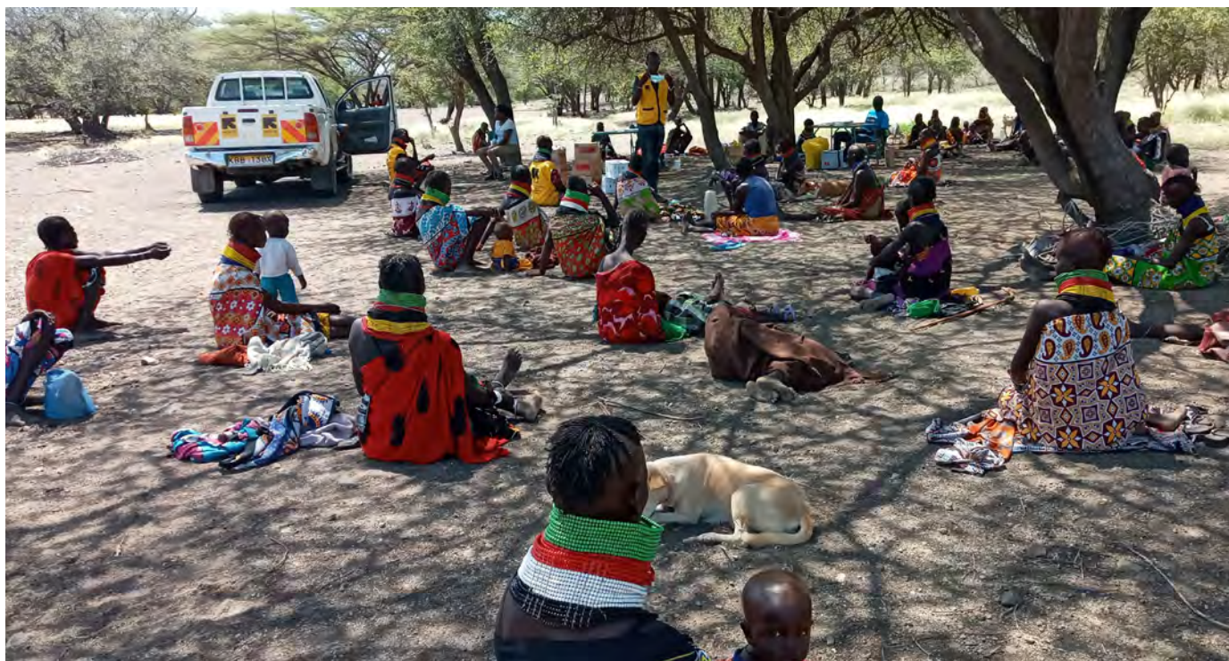
IRC staff conduct mobile outreach in Turkana, Kenya.

This report concludes with recommendations based on interviews with displaced and refugee women, women-led organisations, and humanitarian GBV experts. Their voices, experiences, and knowledge need to translate into effective, accountable, and consistent humanitarian action that truly puts women and girls at the centre of COVID-19 response and recovery efforts.