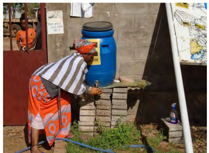
A woman is washing her hands before entering into a safe space in Ethiopia. IRC

The current Global Humanitarian Response Plan (July – December 2020) is a prime example of the duality observed within the current humanitarian response to COVID-19. The July update of the GHRP differed from its predecessors by providing a rare in-depth analysis of how women and girls were being affected by COVID-19 across humanitarian contexts and focusing specifically on GBV as “one of the most nefarious consequences of the pandemic”. xii The narrative about impacts of the pandemic on violence against women and girls was robust. However, the level of specificity and urgency in preventing and responding to GBV in the narrative was not matched in the sections of the GHRP that direct response efforts and establish accountability measures.