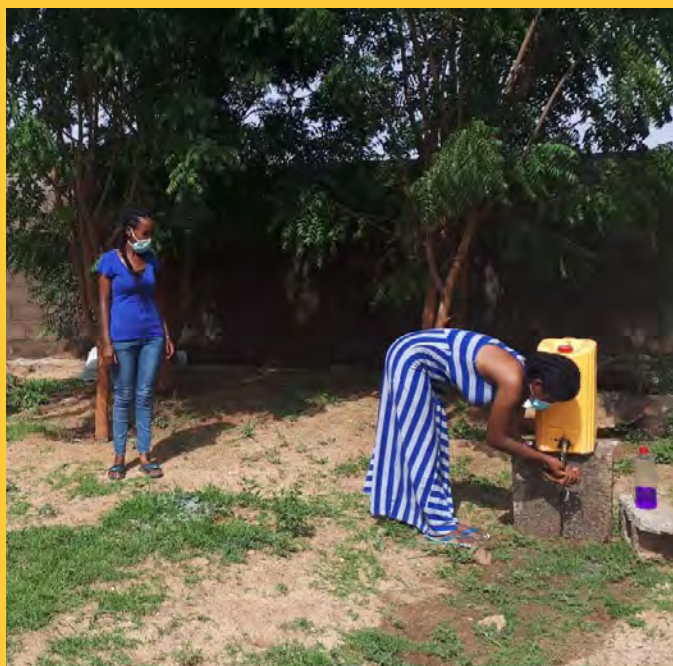
IRC incentive workers line up to wash their hands before entering into a safe space. IRC