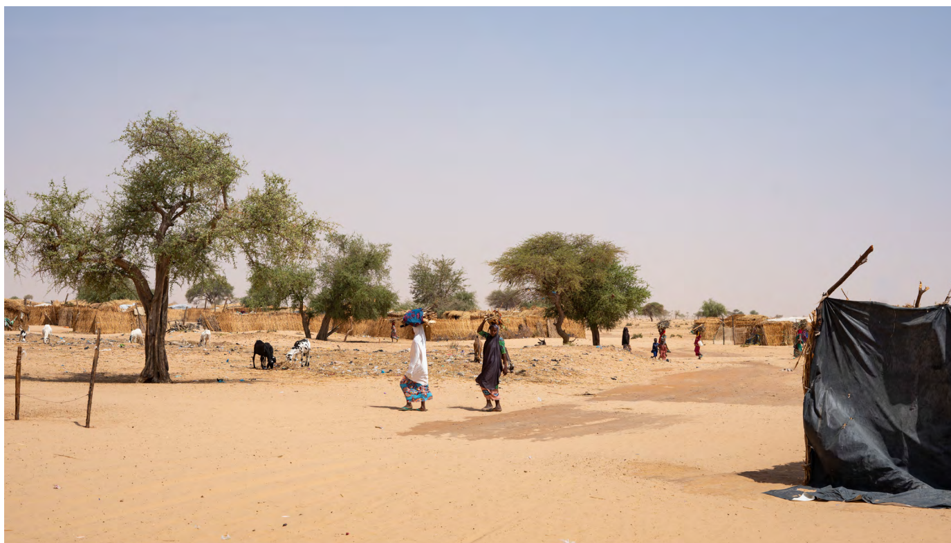
Refugee camp in Awaridi village, 4km from downtown Diffa, where IRC teams operate. Niger.

At the Forum, European countries were also urged to advance negotiations on a Union Resettlement and Humanitarian Admission Framework after a longstanding deadlock. 38 Whereas this Framework could pave the way for more predictable, systematic and long-term resettlement efforts in Europe, the file has remained stuck in negotiations since 2018 as part of the 'package' of Common European Asylum System (CEAS) reform proposals. The commitment to advance the Framework as expressed by leaders at the Forum was commendable. The challenge will be to translate this momentum into practice.