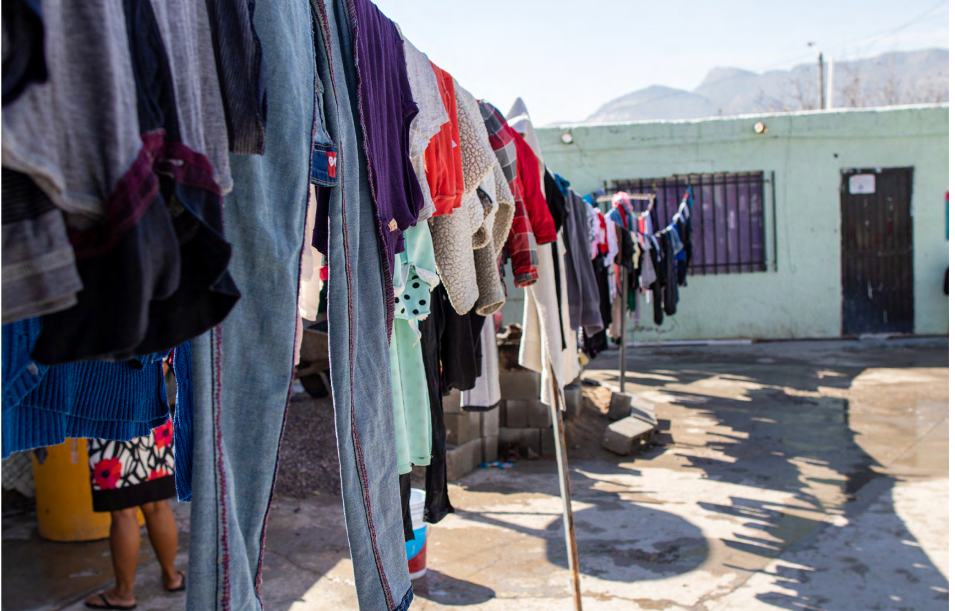
An IRC-supported shelter for asylum seekers in Juarez. Approximately 60,000 people had been stuck awaiting asylum on the border thanks to the "Migrant Protection Protocols" otherwise known as "Remain in Mexico", leaving centres like this one overstretched and underfunded. Mexico.

asylum seekers. Over the last four years, inhumane policies and practices, such as the separation of children from family members at the US southern border under the Zero Tolerance Policy and the implementation of the Migrant Protection Protocols (MPP) greatly impacted access to territory, often forcing individuals back into harm's way. To adequately address the increase in arrivals at US ports of entry and provide support and services for asylum seekers, the US must act swiftly in implementing safe, orderly and humane policies for asylum seekers.