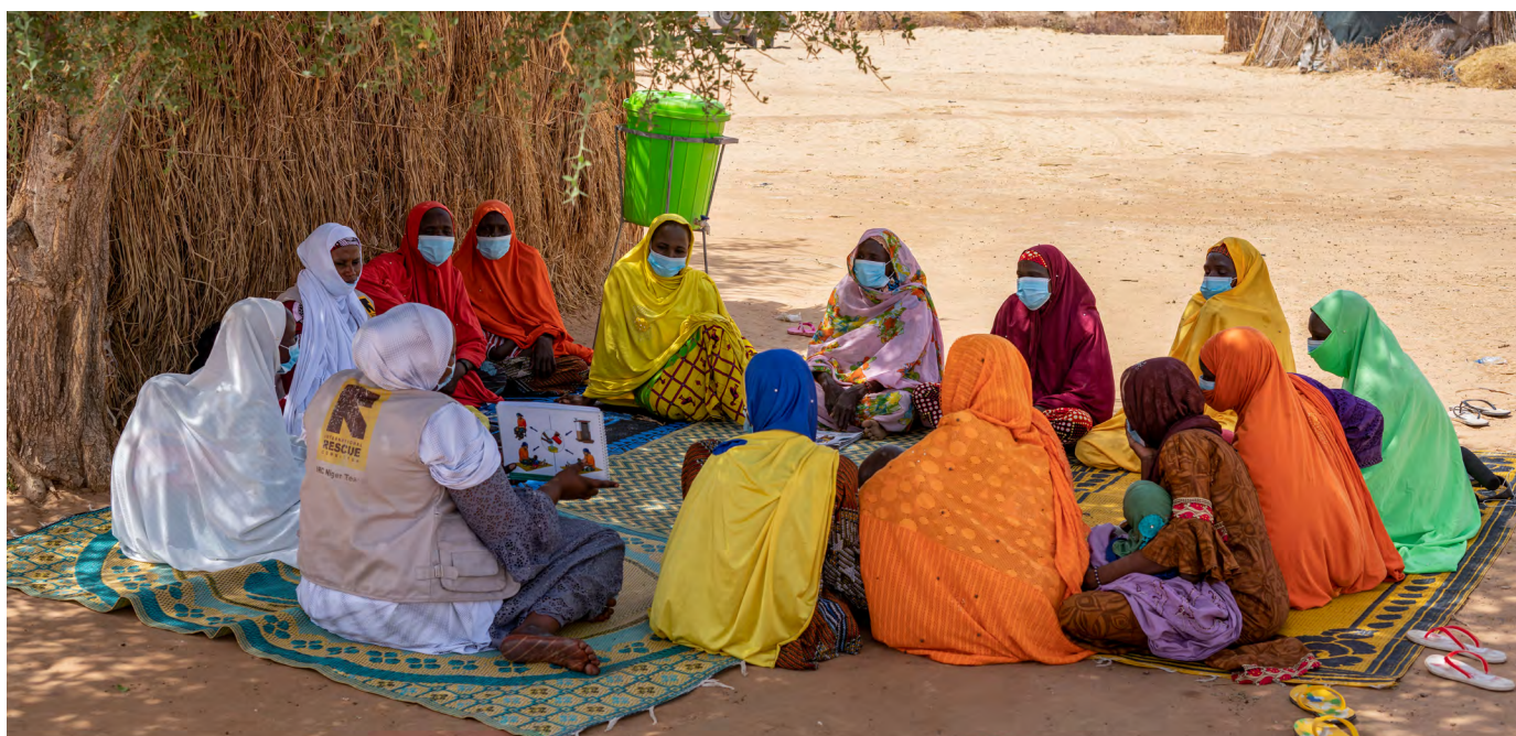
IRC Staffs, members of a nutrition group and mothers talking about how to prevent malnutrition at Awaridi refugee camp. Niger.

Three countries currently host nearly a quarter of the world's refugees. For the seventh consecutive year, Turkey hosted the largest number of refugees worldwide (3.7 million people, nearly all Syrian), followed by Colombia (1.7 million, nearly all Venezuelan) and Pakistan (1.4 million, nearly all Afghan). 21 Meanwhile, high-income countries have consistently hosted just 17% of refugees, with Germany being the only EU country in the top 10 refugee-hosting states. 22