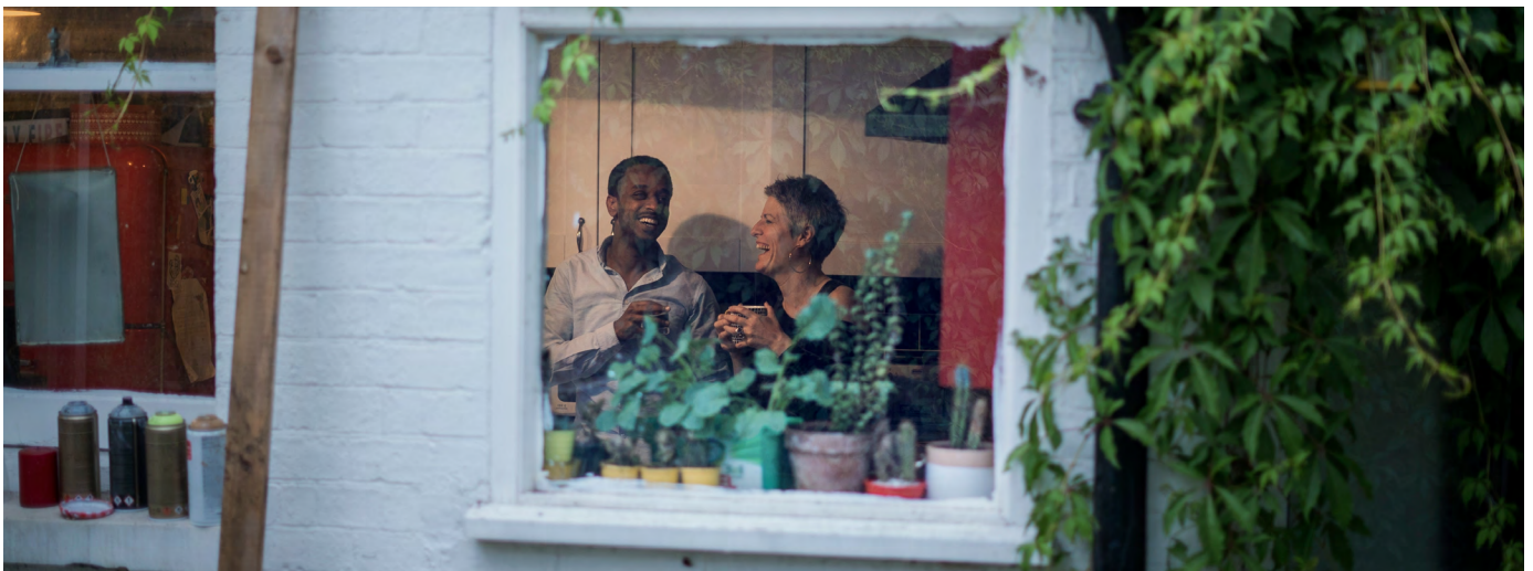
London, UK.