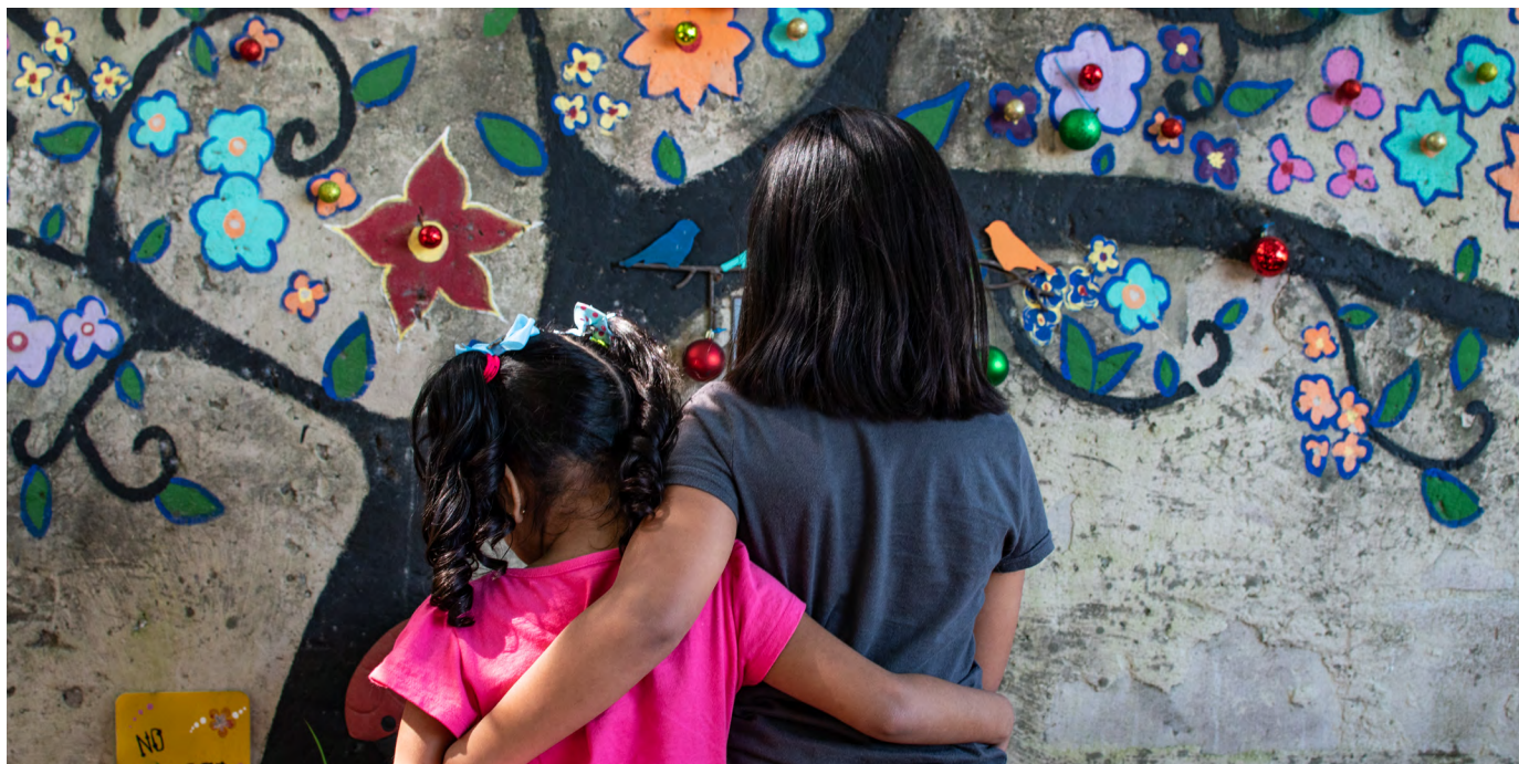
A Salvadorian family in the capital city San Salvador. The family received cash support from the IRC after being in desperate need of support. The father was running a small business when gangs tried to extort him for money. Unable to pay, the gang shot him nine times leaving him with life-long health issues. To support the family, the mother and youngest child (now 5, then 3) left to the United States. Once they crossed the border they were separated and detained for three months. Once reunited they vowed never to separate again. El Salvador.