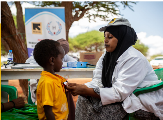
Caption: IRC nutrition nurse measuring a child's arm in a village outside Dhusamareeb, Somalia