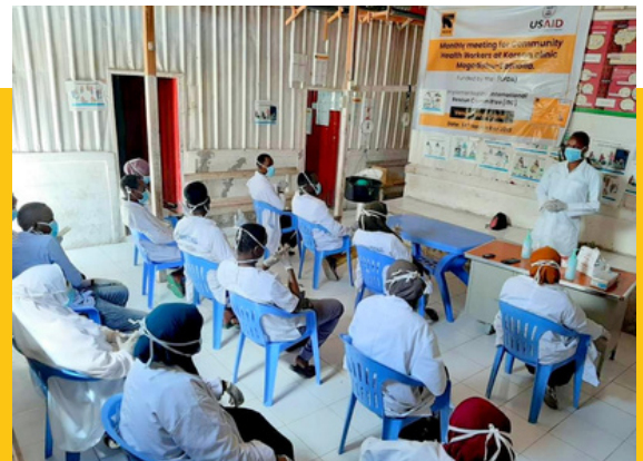
Caption: IRC staff receiving training at Korsan clinic, Mogadishu, Somalia.