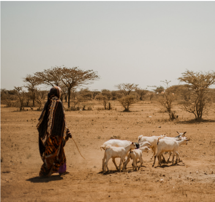
Above: Seada Abdi, a mother of nine children, tending to her goats in Kebri Beyah, Somali region where drought forced her family and animals to resettle in an internally displaced persons camp.

IDA overall commitments to conflict-affected LDCs almost tripled in size from fiscal year 2015 until 2021. 9 Furthermore, the dedicated additional FCV Envelope , which supports the Bank’s FCV Strategy and provides additional resources to countries facing conflict and instability, rose by almost 17% from IDA19 to IDA20 . 10 While these increases are positive, most IDA resource allocation decisions are subject to the performance-based allocation (PBA) system (see Chart A), which favors stable settings. PBA criteria take into account a country’s per capita income as well as other indicators of strong state capacity such as progress on key policy reforms related to budgetary and financial management, public