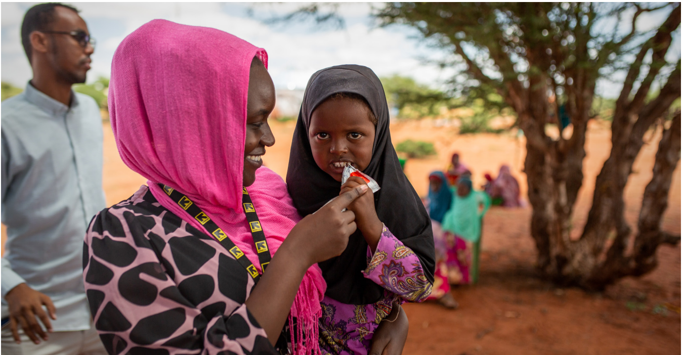
An IRC staff member and a child eating ready-to-use therapeutic food in the Olol village in Somalia, where the share of commitments disbursed was only 41% between fiscal years 2015 and 2022.

These disbursement gaps can be explained in large part by the Bank's low risk threshold and its operating model that primarily works with and through national governments. This government-first approach can lead to project delays and suspensions , especially in conflict-affected states. Limited experience and expertise in delivering in conflict settings, or in areas inaccessible to governments, can lead to concentrations of IDA projects in relatively safe and stable areas rather than in conflict-affected communities, where needs are often highest.