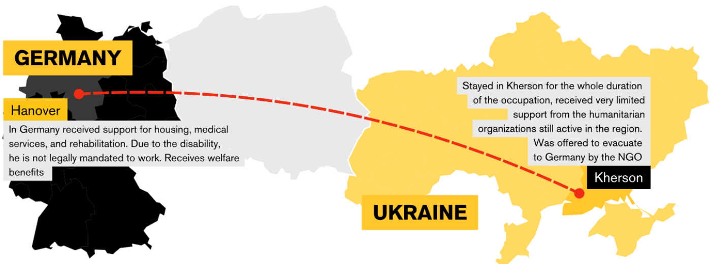
Refugee from Kherson, Germany (Male, 38)