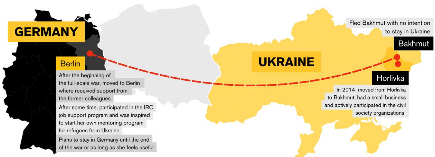
Refugee from Bakhmut, Germany (Female, 46)

Her previous experience and connections to civil society organizations have been instrumental in this pursuit. Although she remains engaged with Ukraine, she does not plan to return for now, as she feels useful and professionally fulfilled in Germany.