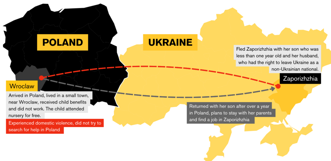
Returnee journey from Zaporizhzhia (Ukraine) to Poland and back. (Female, 30)

A 30-year-old woman from Zaporizhzhia left her hometown with her husband, who was exempt from the martial law as a non-Ukrainian national, and newborn son following the outbreak of the full-scale war. The family settled in a small town near Wrocław, Poland, where she did not work but relied on child benefits, which she highly valued. Her husband, despite not being Ukrainian national, benefitted from the temporary protection in Poland and secured a full-time job.