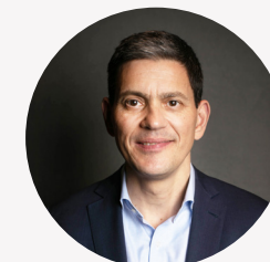
David Miliband IRC President and CEO