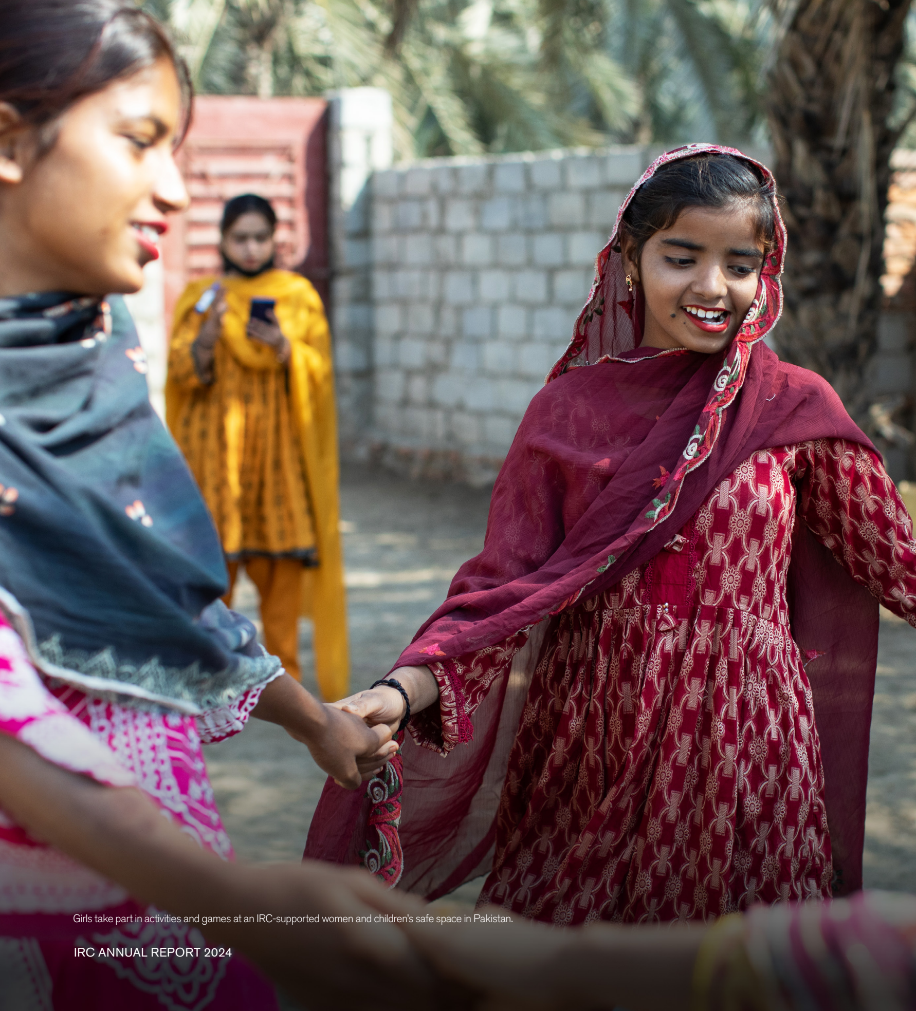
Girls take part in activities and games at an IRC-supported women and children's safe space in Pakistan.