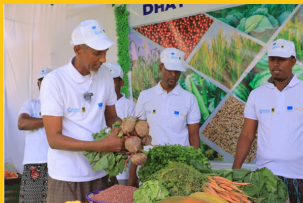
Farmers' cooperatives supported by IRC proudly showcasing their resilience and innovation at the Beledweyne Product Expo under the BRICIS OASIS project.

In 2025, the IRC supported over 53,000 people across Somalia through its livelihood and economic recovery programs. Over 34,000 individuals (54% women) received cash assistance worth USD 1.2 million, helping families meet essential needs and protect their livelihoods. Additionally, more than 1,200 farmers adopted climate-smart practices with access to quality seeds, tools, and irrigation support, while 65 VSLAs strengthened financial inclusion and resilience within their communities. These efforts continue to lay the foundation for sustainable, inclusive growth and climate-resilient livelihoods across Somalia.