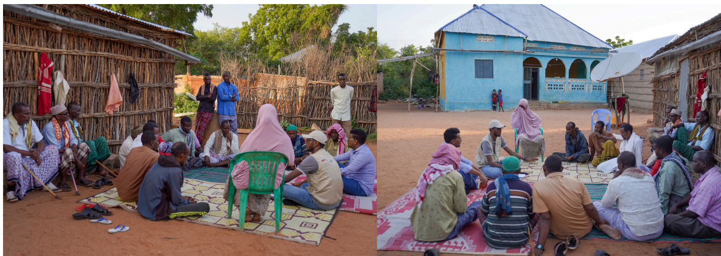
IRC staff meeting with local peace committee in Dinsor.