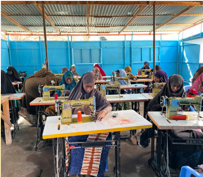
Women and girls in safe space learning tailoring skills in Dhusamareb, Galmudug