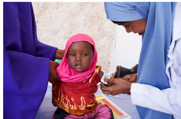
A nurse working with IRC's mobile health team in Mudug region provides a medical check up to diagnose malnutrition for an 8 year old brought at the Bandiradley hospital.