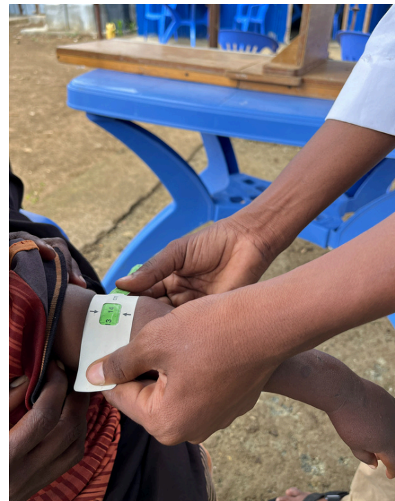
Nurse Practitioner in Baidoa, Somalia, screening a baby for malnourishment.