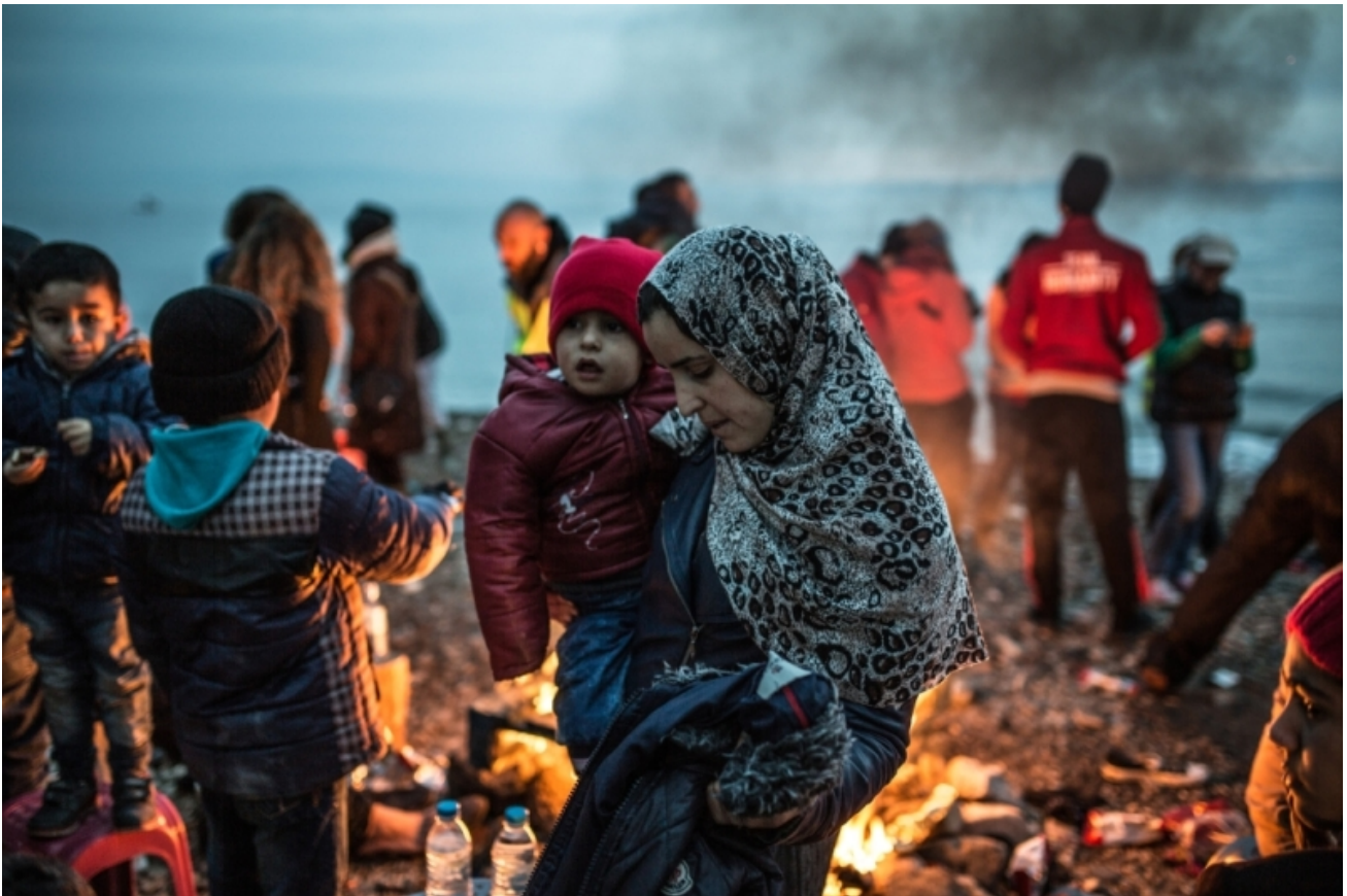
Refugees try to keep warm by a fire on the shore of Lesbos in February 2016.