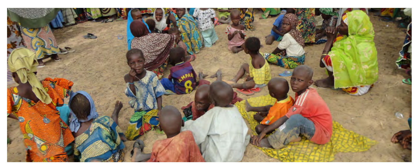
Above: As new waves of violence engulf Nigeria, more than 2,000 people fled their homes into Guesseré, the Republic of Niger.

Despite longstanding commitments to policy coherence for development, alignment between the EU's external policies still remains insufficient, while commitments to build long term outcomes for crisis-affected populations are often de-prioritised. This narrow approach to crisis mitigation has failed to appreciate the transformative potential of the SDG agenda to build individual and institutional resilience to political, environmental and economic shocks that undermine peace and stability. Crisis and sustainable development are inextricably linked, and lasting security in the region can only be achieved through significant improvements in access to services, rights and protections for vulnerable populations in the Sahel. Establishing a shared vision and common action around the SDGs is a key commitment within the EU's Global Strategy<sup>1</sup>, and vital for achieving its partnership aspirations with African states to build resilient societies.