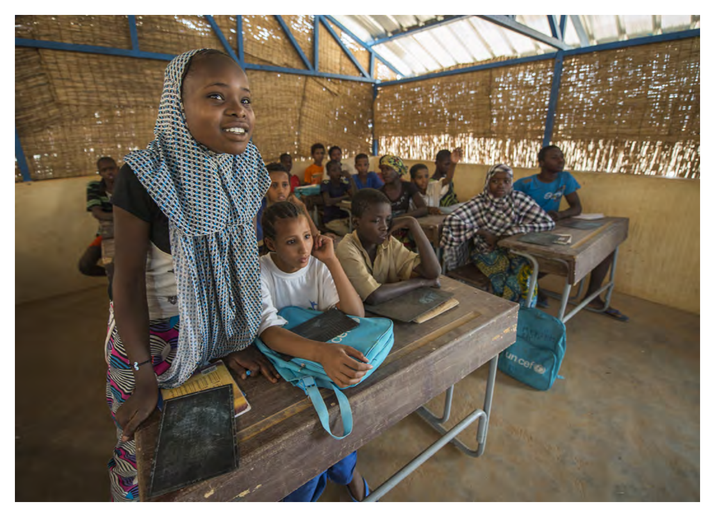
Above: Malian children in an IRC-supported school in Tabareybarey camp, Niger.

funding between 2016 and 2019<sup>12</sup>, there is an urgent need to significantly scale up investments in GBV prevention and response, in line with commitments under the Call to Action to End Gender Based Violence<sup>13</sup>. GBV services are not only lifesaving for women and girls, but are also vital for their pursuit of all other SDGs. Violence inhibits access to health, education, jobs and leadership roles for women and girls within their communities, which are essential for challenging social norms that continue to disempower them.