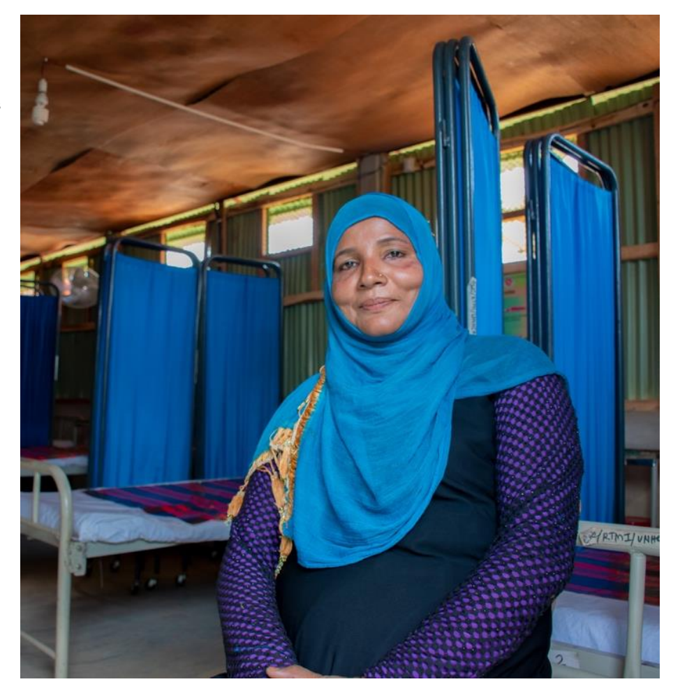
Photo: Senwara is a volunteer at the IRC supported comprehensive women's centre.

Host and refugee inter-community Examples of host and refugee inter-community risks include sexual violence and harassment, theft, conflict over resources, the illicit drug trade, perceptions of 'otherness', and general violence.