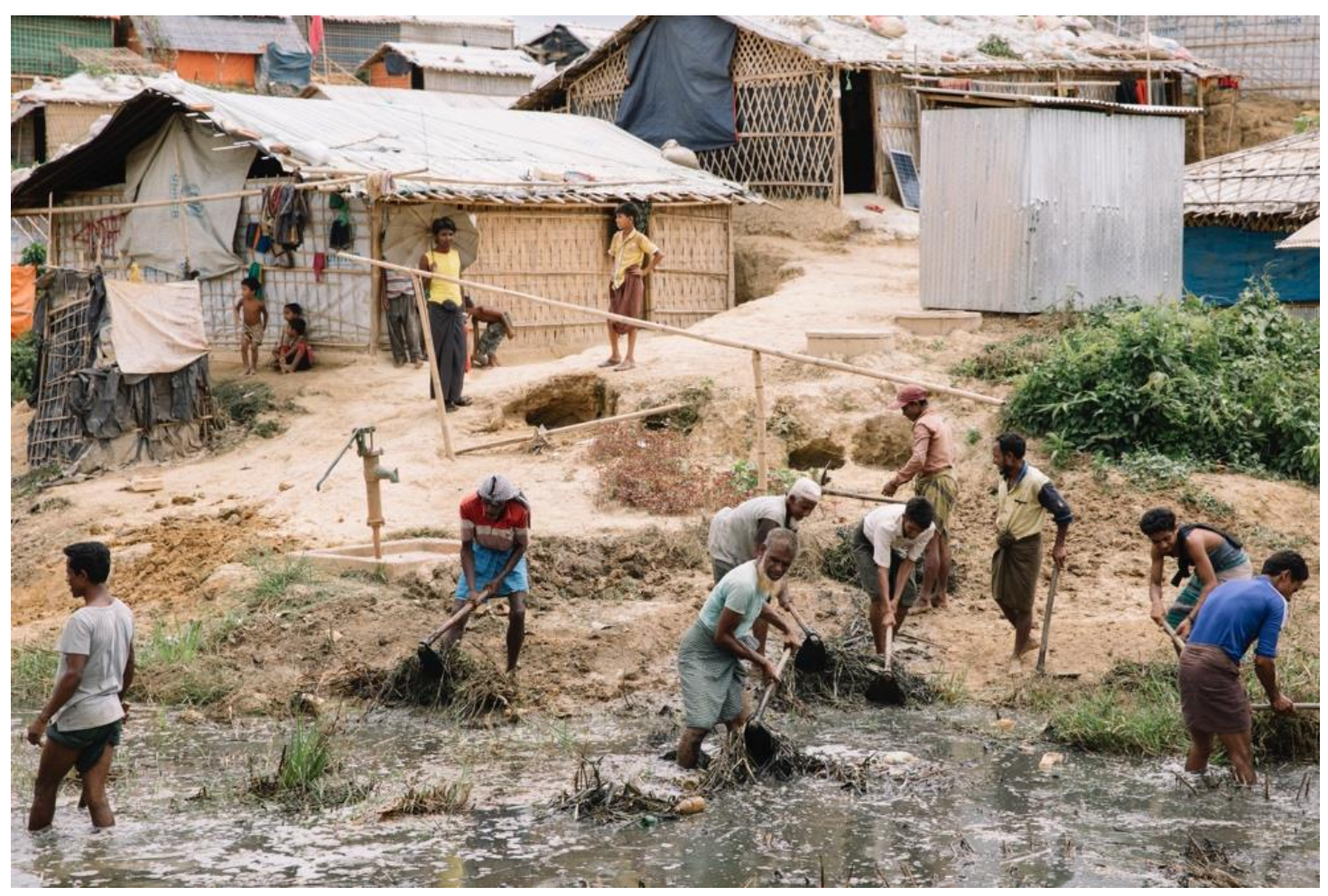
Refugee men work to clear a water channel in Kutupalong Refugee Camp in preparation for monsoon rains.

interventions have the further potential to strengthen local legal systems and positively contribute to greater social cohesion between refugee and host communities<sup>4</sup> laying the groundwork for long-term regional stability and safe refugee returns.