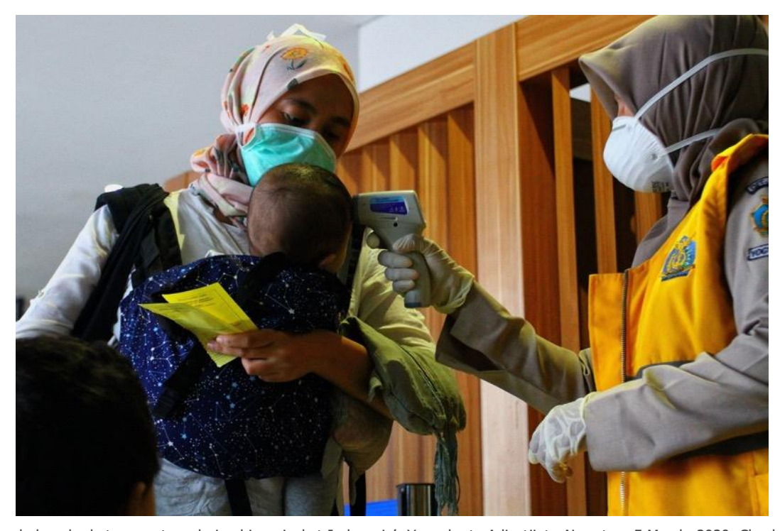
Officers check a baby;s body temperature during his arrival at Indonesia's Yogyakarta Adisutjipto Airport on 5 March, 2020. Checks are carried out to prevent the entry of COVID-19 into the city of Yogyakarta, a tourist destination.

From 12–20 March 2020, a brief secondary data analysis and write-up was undertaken to analyse and explore the current and potential gendered dimensions of the COVID-19 pandemic. The report provides recommendations for the humanitarian system and humanitarian actors to ensure consideration of the gendered dimensions of risk, vulnerability, and capabilities in response and preparedness to this crisis, with a lens toward enabling support for existing humanitarian needs. This report does not aim to answer questions about the epidemiology and pathology of COVID-19.