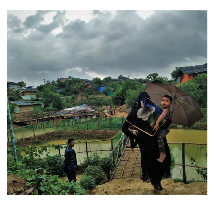
Above: A Rohingya woman carries her child through Kutupalong camp as a storm approaches.

This report calls for a surge in cross-sector effort, particularly in light of the exponential risks posed by COVID-19, for new funding for specialised GBV expertise, and a boost in capacity to ensure that the Rohingya women and girls of Cox's Bazar are safe, protected, and supported to recover and thrive.