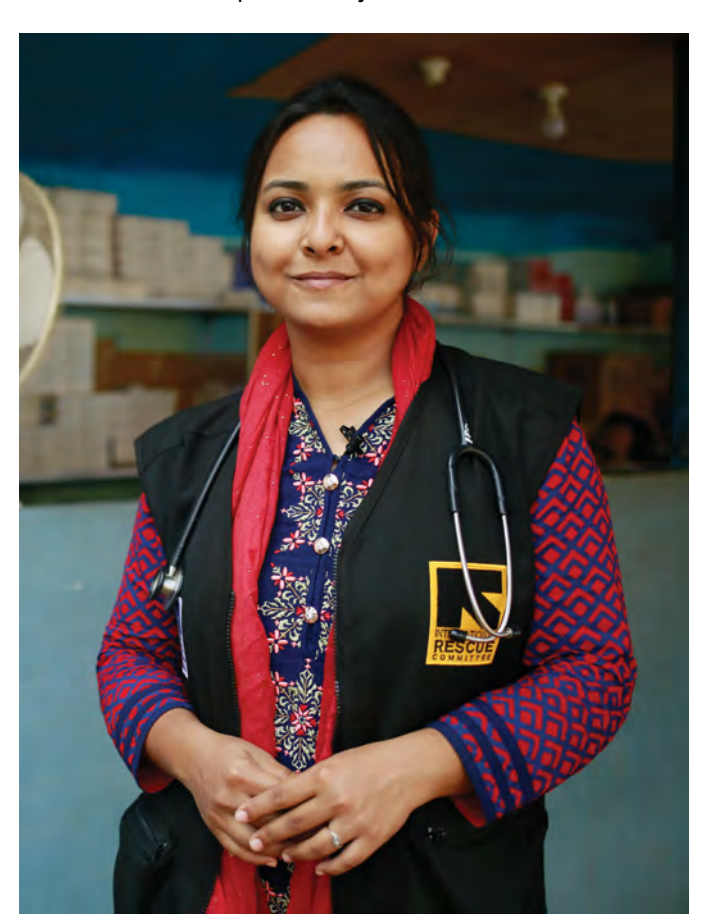
Above: An IRC worker stands outside of an IRC health facility in Teknaf camp.

All women and girls screened at IRC women's centres and health programming sites who reported sexual assault accepted Clinical Care for Sexual Assault Survivors (CCSAS) services provided by the IRC.