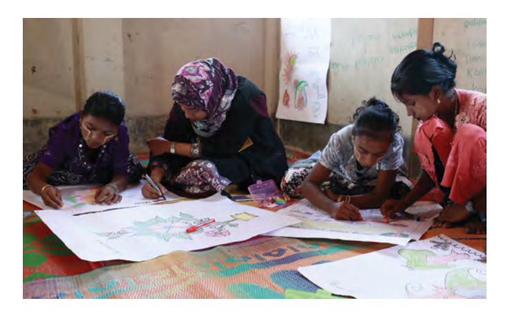
Above: Children draw and play in a safe space in the IRC's Women's Centre, Teknaf camp.

The root of GBV is gender inequality between women and men which manifests as deep-rooted sexism within the society. Working with men and boys, with guidance from women and girls, through prevention and risk reduction programming can help tackle the negative outcomes of restrictive and sexist social norms on women and girls. In the first half of 2019, 232,466 Rohingya were reached through GBV subsector awareness raising and community mobilisation programmes - however only 22 percent were men and boys.xviii Reaching men and boys requires consent from involved parties, and such interventions can take time. Social change programmes such as the IRC's Engaging Men through Accountable Practice (EMAP)xix work with men to foster transformational attitude and behavioural changes guided by the voices of women and girls. Community outreach and dialogue with Rohingya community leaders to challenge destructive or damaging behaviourxx also plays an important role. Other programmes, such as the IRC's Girl Shinexxi curriculum, work with both adolescent girls and their parents/care-givers to protect and empower girls as well as support their safety and agency for self-determination. Prevention and transformation of gender norms are further tackled by sessions for women and girls on GBV and Sexual and Reproductive Health-related topics, which are held on a weekly basis in the IRC's Integrated Women's Centres, with feedback from participants in coordination with IRC staff.