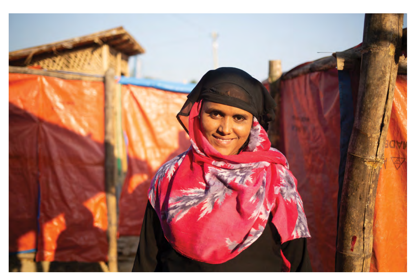
Above: An IRC Rohingya volunteer stands outside the IRC Women's Centre in Teknaf camp.