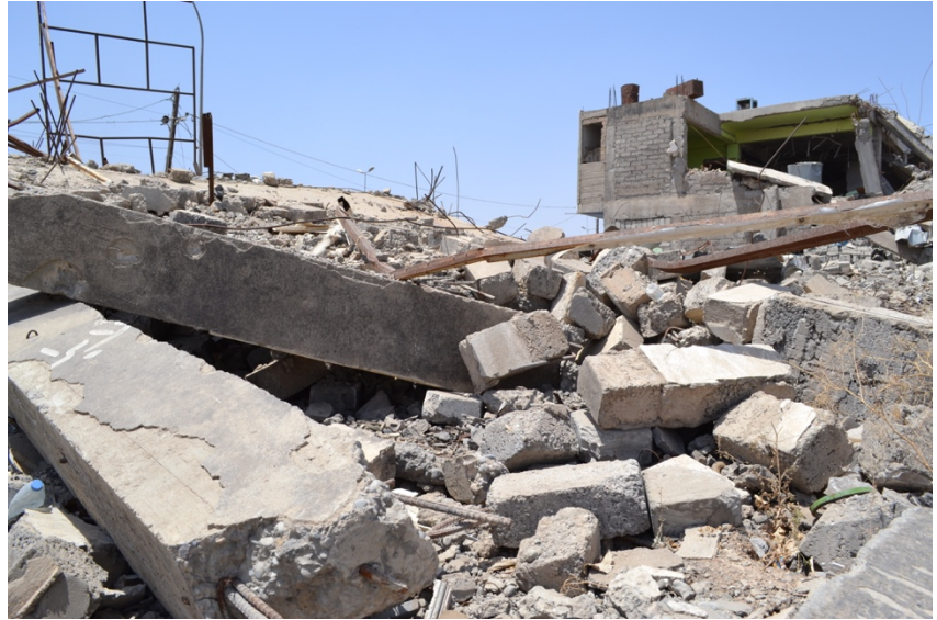
Photo: Destruction left behind after the battle to retake East Mosul from ISIS.

Thus far, however, available data suggests that barriers to goods and services are caused by insufficient capital and logistical constraints. As evidenced by the last multi-sector needs assessment conducted across East and West Mosul in June 2017, the primary challenge associated with food insecurity in Mosul, and in the