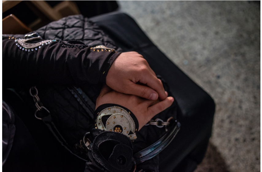
Photo: A woman in East Mosul takes part in an awareness raising sessions at IRC's women's centre in the city.

Women participants of FGDs, particularly in Karama, said that they needed general confidence-building and life skills development in order to learn how to promote themselves in the labor market as well as advocate for their needs in their communities and households. They saw this as an important step to improve women's access to the labor market and to raise awareness in their communities about the