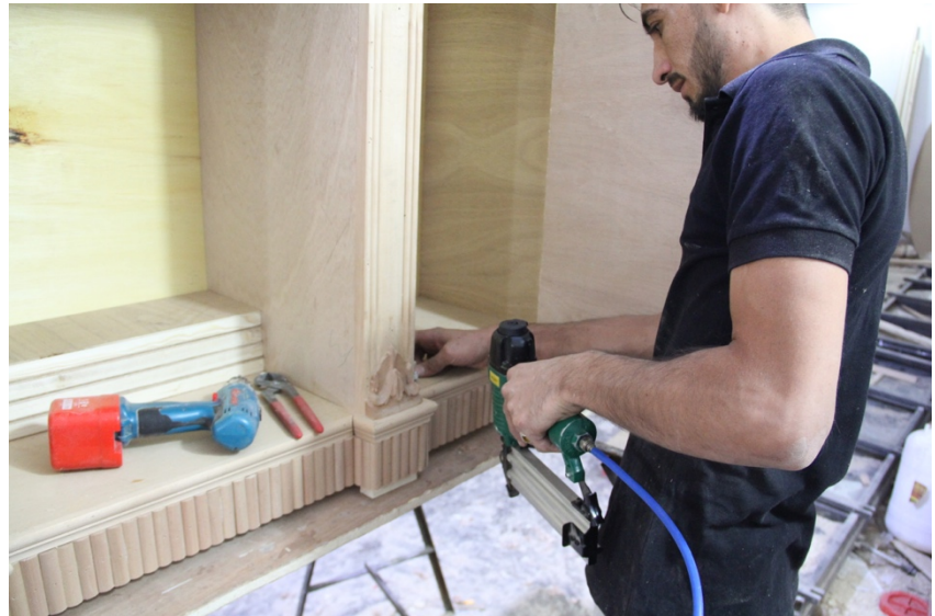
Photo: A man from West Mosul works in a carpentry shop in East Mosul.

During FGDs, participants were asked how much income families like theirs would need to support basic needs for one day. A majority of male participants across locations said that they would