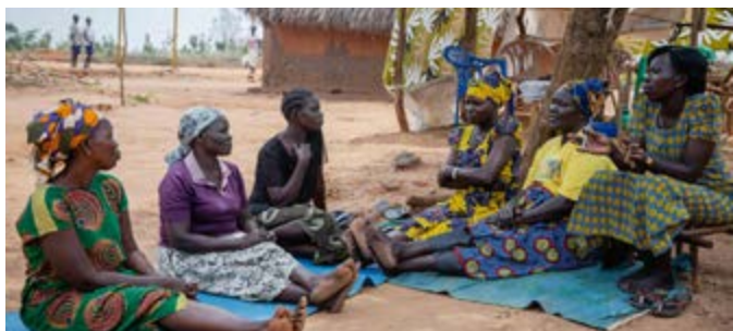
Members of the Togoleta women's group counsel a woman from Bidibidi camp, who is seeking their advice in a difficult situation.

According to key informants, there was a delayed recognition, particularly within public health teams on the ground, of the impact of COVID-19 on women and children, particularly girls, including in terms of caring and hygiene responsibilities, sexual and reproductive health, and GBV. This partial or delayed acknowledgment resulted in early public health interventions that did not prioritise providing PPE specifically designed for female health staff, nor appropriate menstrual hygiene management supplies, nor the ongoing provision of abortion care and other essential sexual and reproductive health services. Public health strategies also relied, in some humanitarian contexts, on the repurposing of women and girls' safe spaces as COVID-19 isolation or treatment centres, without any alternative arrangements put in place to ensure continuity of lifesaving GBV services.