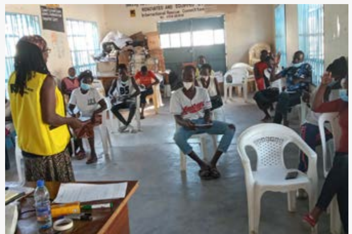
A community volunteer conducts a one day sensitisation session with adolescent boys to address the role of men and boys in GBV prevention and response in Lodwar, Kenya.

While the positive response from the government and the humanitarian leadership in Kenya facilitated the necessary prioritisation and adaptation of GBV services across refugee camps and host communities in the north of the country – the continued lack of funding did not allow GBV responders to capitalise on these commitments to scale up programming to meet the increasing demand.