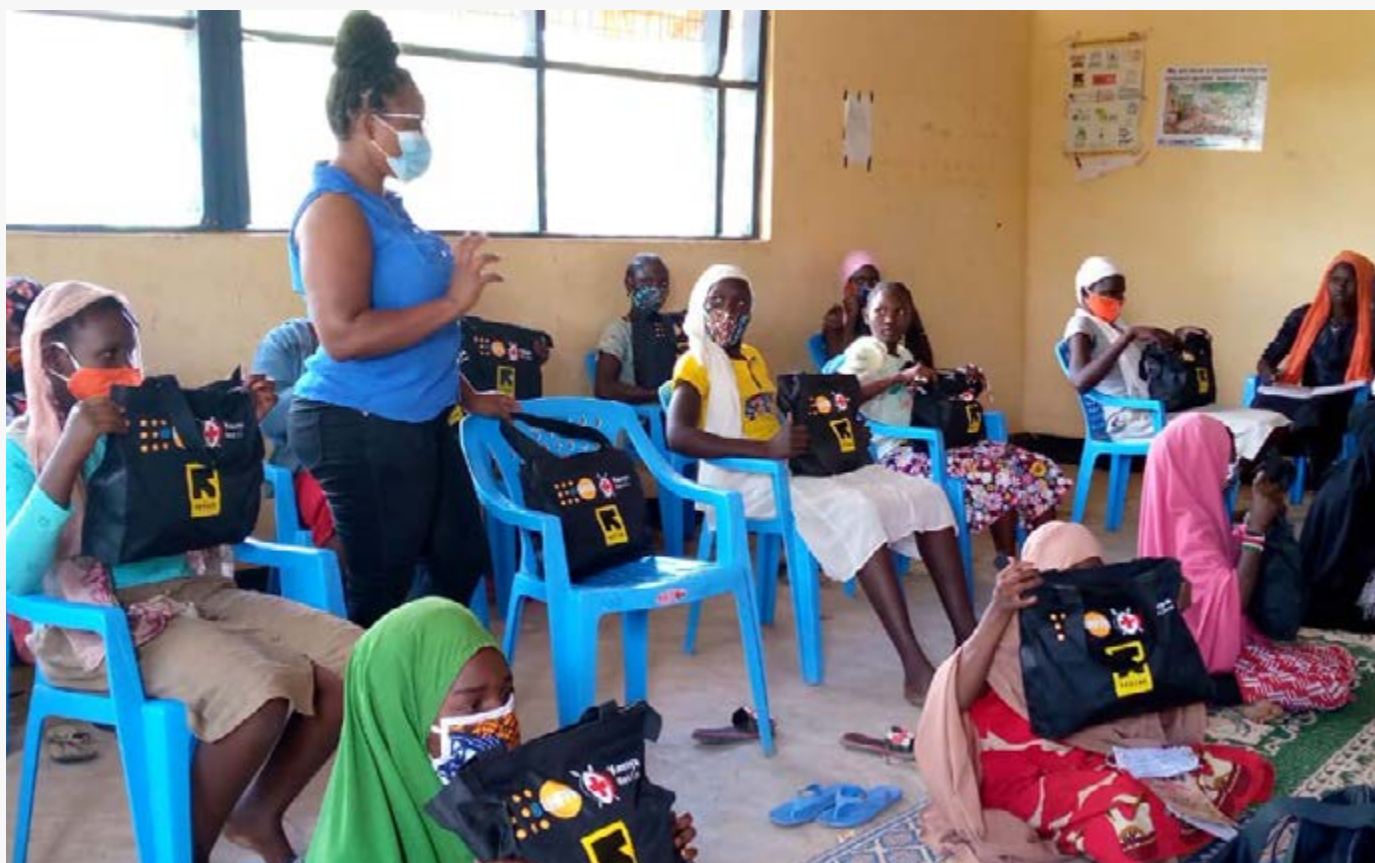
Distribution of dignity kits to adolescent girls in Kenya.

Overall, refugee and host community women and girls in Kenya continued to have access to essential GBV services throughout the pandemic. Strong advocacy for the inclusion of GBV services in humanitarian planning and response, capacity building for GBV actors and local structures, effective coordination among GBV actors, and the involvement of women's organisation were all highlighted as critical factors enabling a sustained attention towards the needs of women and girls in the country, including in refugee camps. While insufficient resources limited the extent to which services could be adapted or even expanded to respond to increased risks for women and girls, ultimately the GBV sector was successful in its efforts to ensure that survivors of violence were not left behind.