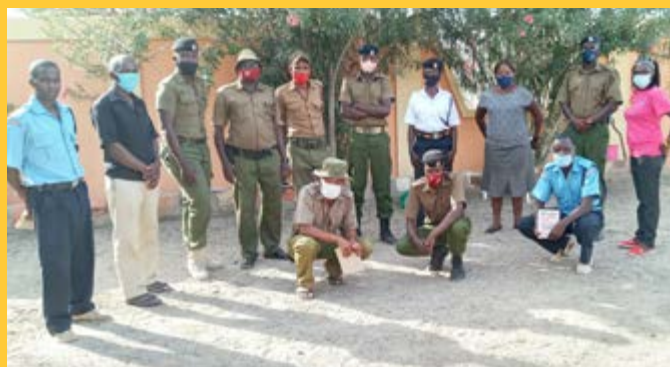
Members of the police in Turkana county after finishing a two day training to foster a comprehensive and coordinated response to GBV and to strengthen the capacity of police officers to adequately respond to GBV in Lodwar, Kenya.

“Provide separate toilet for female and male, construct disability friendly latrines.” (Female respondent, Ethiopia Safety Audit)