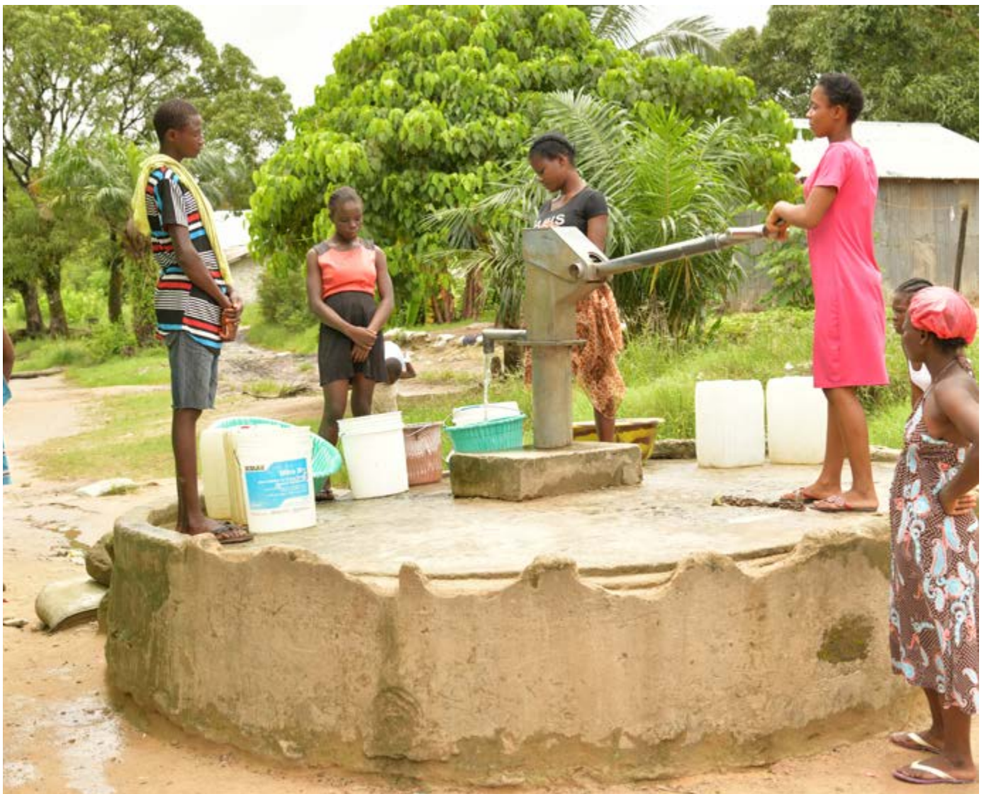
Adolescents are fetching water at a water point in Liberia.

Many female respondents feared that even when schools opened, girls would not be allowed to return. Thus, there were requests to ensure that schools open as soon as possible, but also a focus on the need for advocacy to ensure that when schools do open, girls can go back and be educated. Other suggestions called for more safe spaces, or educational activities for girls where they can share their experiences and difficulties, and access reproductive health information to reduce the risk of teenage pregnancy.