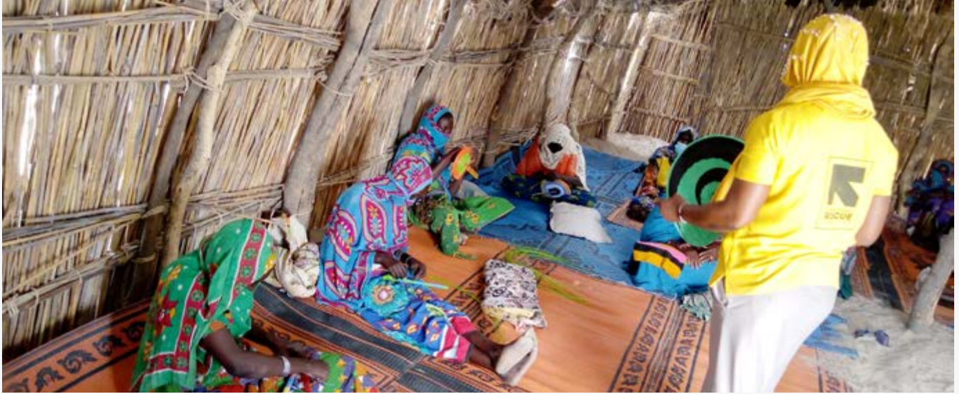
Women during a recreational basket weaving activity in Chad. IRC