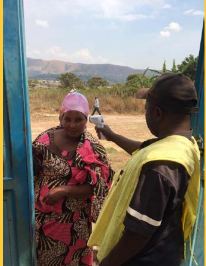
An IRC staffer takes the temperature of a women before entering a Hope Centre in Burundi. IRC