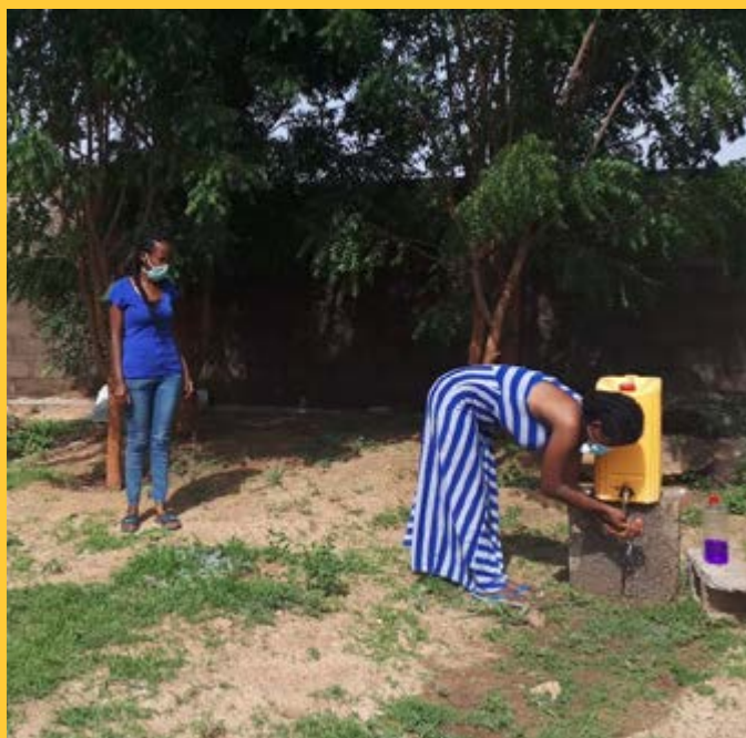
IRC incentive workers line up to wash their hands before entering into a safe space.