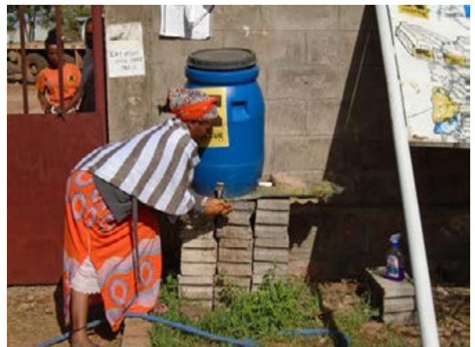
A woman is washing her hands before entering into a safe space in Ethiopia.

The current Global Humanitarian Response Plan (July – December 2020) is a prime example of the duality observed within the current humanitarian response to COVID-19. The July update of the GHRP differed from its predecessors by providing a rare in-depth analysis of how women and girls were being affected by COVID-19 across humanitarian contexts and focusing specifically on GBV as “one of the most nefarious consequences of the pandemic”. xii The narrative about impacts of the pandemic on violence against women and girls was robust. However, the level of specificity and urgency in preventing and responding to GBV in the narrative was not matched in the sections of the GHRP that direct response efforts and establish accountability measures.