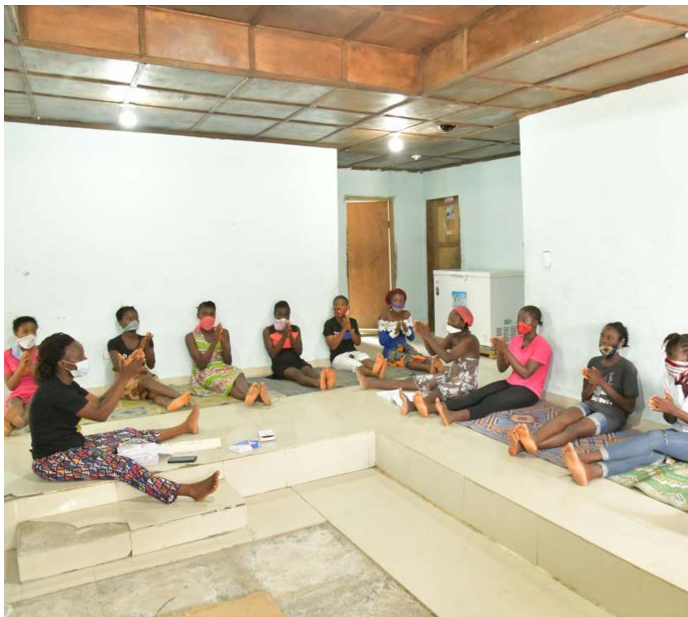
Adolescent girls during a girls meeting in a safe space in Liberia.

Safety Audits in each location were primarily implemented to keep in touch with women focal points within each community during limited movement due to COVID-19 infection restrictions. Regular calls with community focal points and a standardised interview guide enabled WPE teams in each location to identify risks and barriers to service access and to advocate with humanitarian actors to mitigate risks and remove barriers to women and girls safe and equitable access to aid in each setting. This data was then also shared for global analysis and advocacy. Two primary questions guided the data collection and analysis which informs this report. Firstly, the safety audit interview data sought to answer the question: How did COVID-19 affect the lives of women and girls in emergencies? ; and secondly, all data contributed to addressing the question: Did the humanitarian sector prioritise GBV services for women and girls in its COVID-19 response?