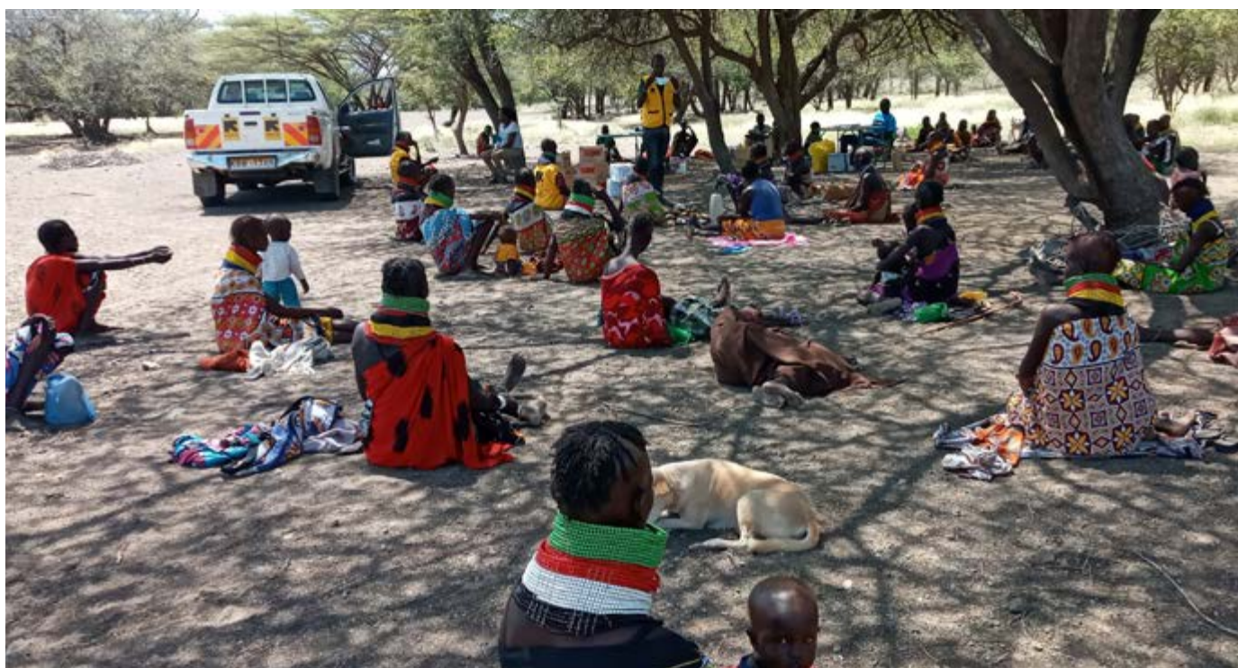
IRC staff conduct mobile outreach in Turkana, Kenya.

This report concludes with recommendations based on IRC interviews with displaced and refugee women, women-led organisations, and humanitarian GBV experts. Their voices, experiences, and knowledge need to translate into effective, accountable, and consistent humanitarian action that truly puts women and girls at the centre of COVID-19 response and recovery efforts.