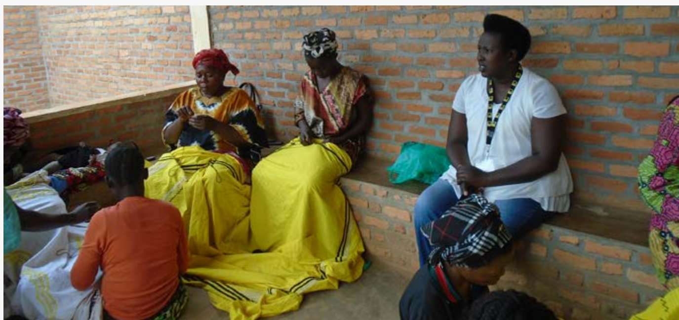
Women during a recreational sewing activity in Burundi.

"Mental preparation is what was done, but there were no funds coming through. Yes, the women's centre remained opened and operational, but survivors could not access it due to increased cost of transport and the fact that most women lost their livelihoods with the closure of the borders" (National GBV expert)