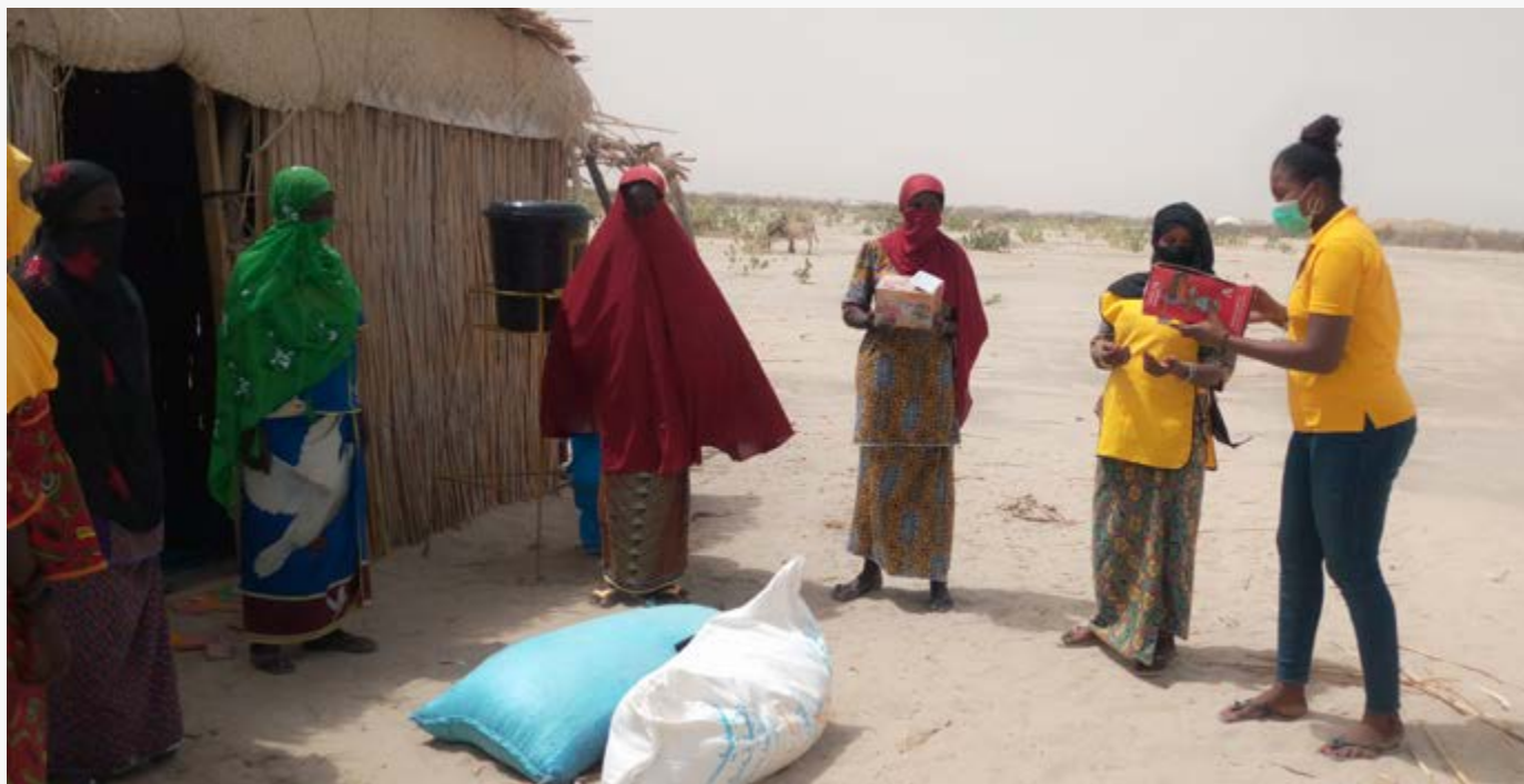
Distribution of dignity kits to women's groups in Chad.