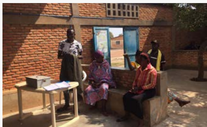
A session of IRC's economic and social empowerment (EA$E) framework is conducted in Burundi. IRC

The GBV sub-sector in Burundi was able to advocate for the inclusion of women and girls' needs and GBV services in planning and preparedness exercises by humanitarian actors. In addition, even though the government did not establish a national lockdown or other restrictive measures, GBV service providers working in refugee camps were able to plan and, to a certain extent, implement adaptation measures to limit the spread of COVID-19, such as using tablets and mobile hotlines to remain in touch with GBV survivors and using radios to continue awareness raising. Despite the extensive planning activities, GBV actors struggled to secure sufficient funding to cover additional needs. Ultimately, this case points to the need to not only plan, but secure funding for the planned interventions.