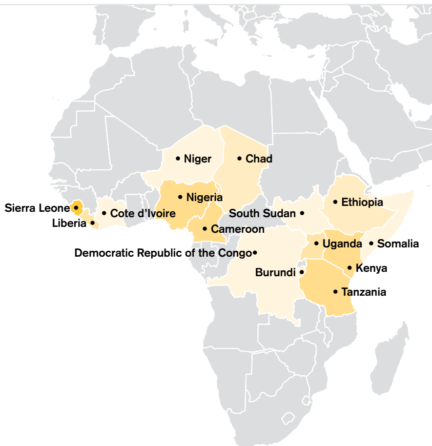
Number of Respondents