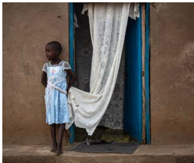
A girl is standing outside her family's house in Bidibidi camp, Uganda.

"The days gone by if we couldn't find the social worker we had to wait for her the other day but for the moment we talk by phone and that helps us a lot and there are many people who give us good reports concerning this service." (Female respondent, Burundi Safety Audit)