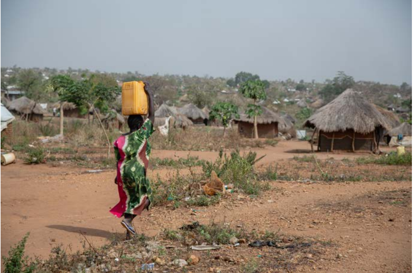
A woman carries a jerrican after collecting water at a water collection point in Bidibidi camp, Uganda.