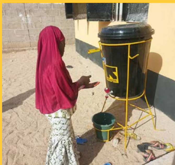
Hand washing practice at a hand washing station by some of the adolescent girls accessing the safe space in Mubi North, Nigeria. IRC

The pandemic is yet another example of how complex humanitarian crises disproportionately affect the most marginalised women and girls. But it also offers us a chance to learn and build back better. xxi The findings of this report clearly highlight the needs to shift the ways of working within the humanitarian crisis response towards a more inclusive approach. We need to actively seek out and listen to voices of those most marginalised. Their perspectives needs to feed into decision making at the local and global level alike. This calls for agreed channels and procedures to ensure actors like women's rights organisations working in their communities are resourced and empowered to meaningfully participate in humanitarian planning.