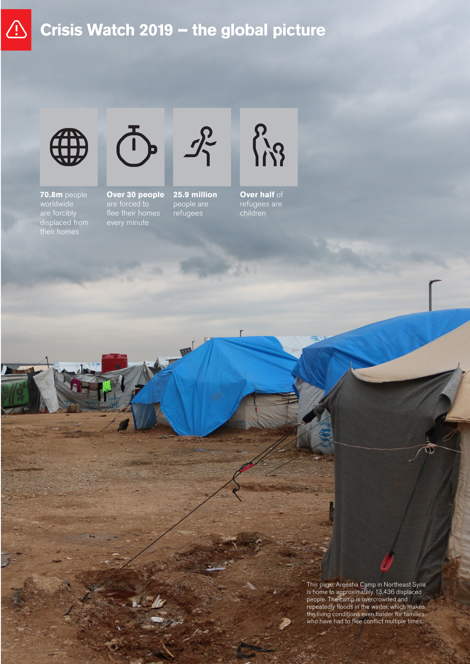
This page: Areesha Camp in Northeast Syria is home to approximately 13,436 displaced people. The camp is overcrowded and repeatedly floods in the winter, which makes the living conditions even harder for families who have had to flee conflict multiple times.