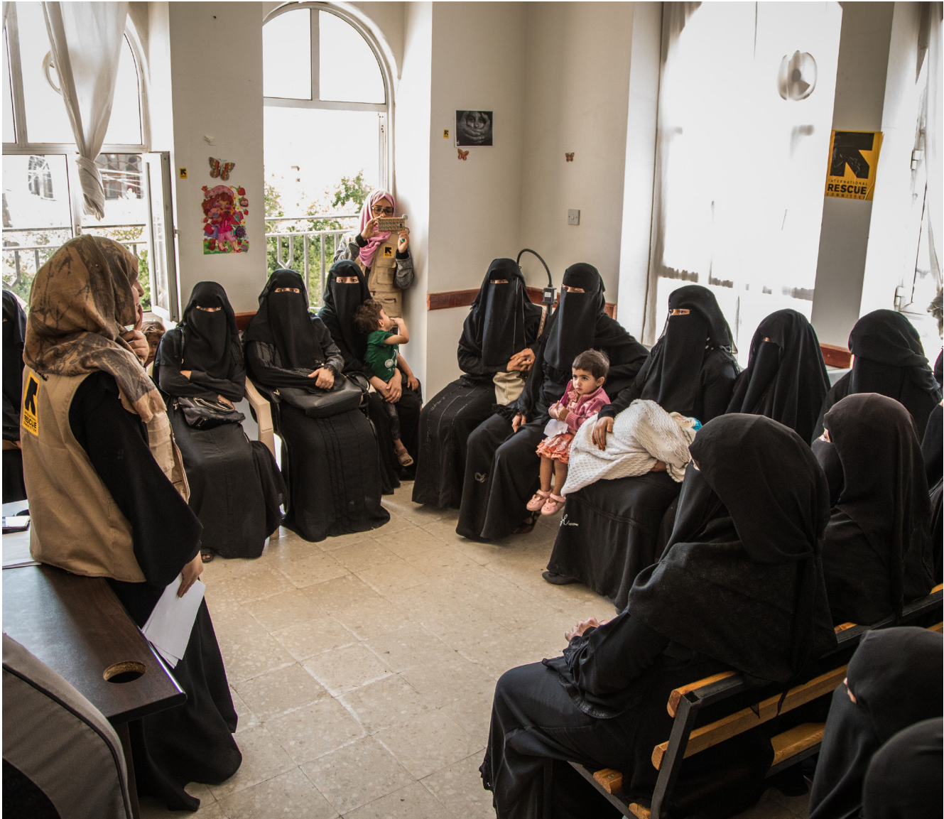
Opposite: The IRC’s Gender Equality unit in Yemen holds weekly sessions at IRC-supported Helal Heath Centre, where they discuss issues of gender, protection, child protection and health and nutrition with women who seek care at the clinic for themselves and their children.