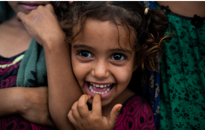
Above: A young child at an IRC mobile clinic operating in the suburb of Bir Ahmed on the outskirts of Aden, Yemen, reaching vulnerable families displaced by conflict who cannot afford to access medical services.

Flexible, private funding in addition to generous support from our partners enables the IRC to adapt to the changing contexts and respond where needs are greatest.