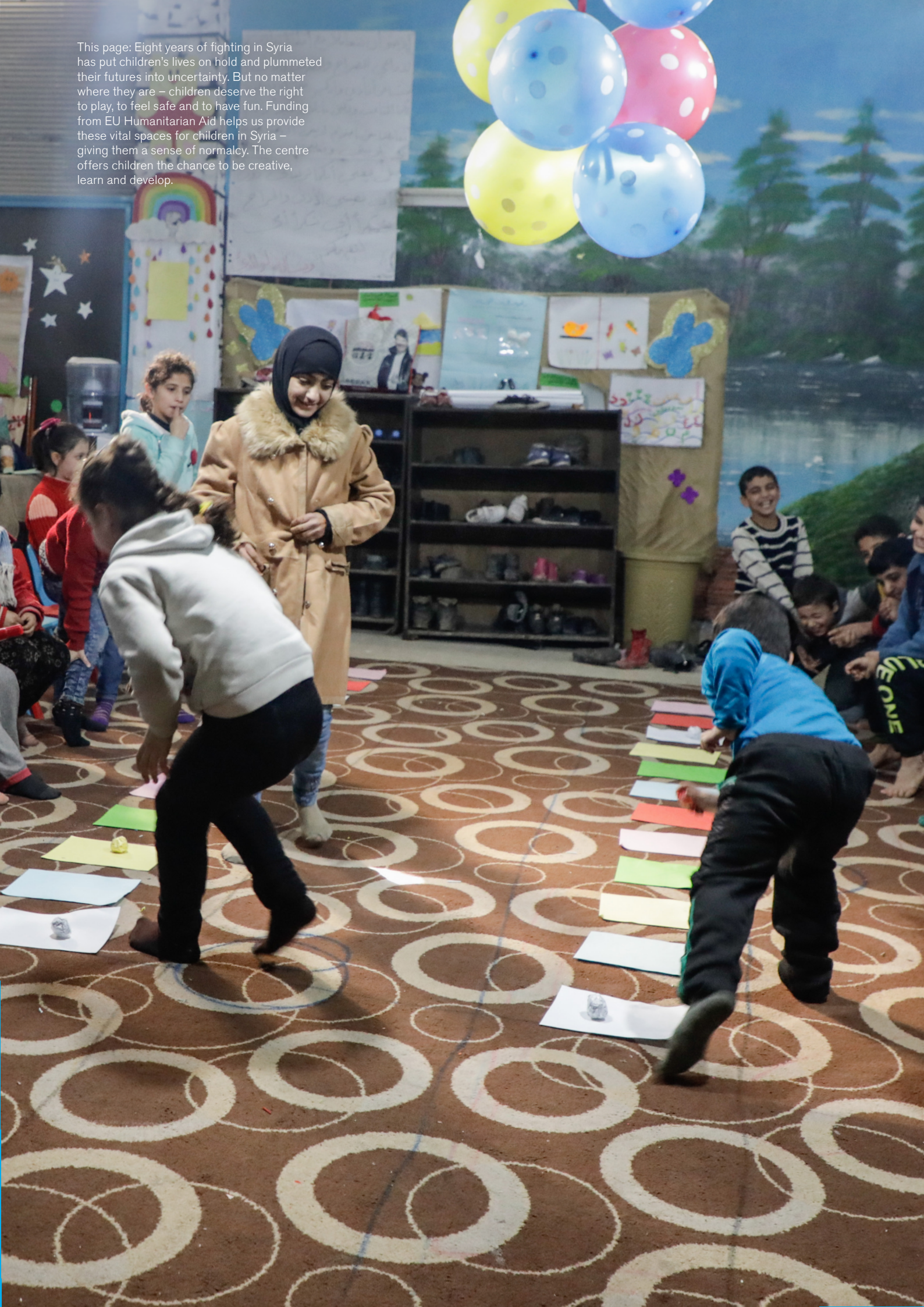
This page: Eight years of fighting in Syria has put children's lives on hold and plummeted their futures into uncertainty. But no matter where they are – children deserve the right to play, to feel safe and to have fun. Funding from EU Humanitarian Aid helps us provide these vital spaces for children in Syria – giving them a sense of normalcy. The centre offers children the chance to be creative, learn and develop.