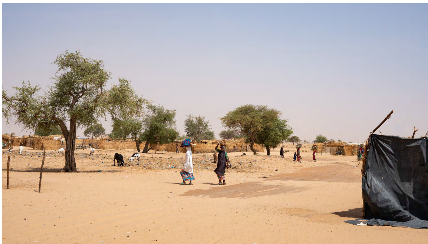
Refugee camp in Awaridi village, 4km from downtown Diffa, where IRC teams operate. Niger.

At the Forum, European countries were also urged to advance negotiations on a Union Resettlement and Humanitarian Admission Framework after a longstanding deadlock. 38 Whereas this Framework could pave the way for more predictable, systematic and long-term resettlement efforts in Europe, the file has remained stuck in negotiations since 2018 as part of the 'package' of Common European Asylum System (CEAS) reform proposals. The commitment to advance the Framework as expressed by leaders at the Forum was commendable. The challenge will be to translate this momentum into practice.