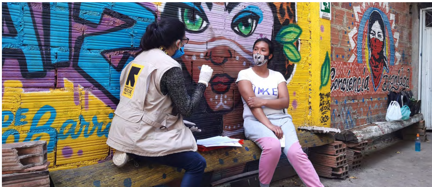
IRC staff distributing cards as part of emergency cash transfer program in Ciudad Bolivar, Bogota, to help 140 Venezuelans pay for shelter and food, during the pandemic. This emergency assistance is made possible with OFDA support. Colombia.

Faltering action by the EU and the US is having serious consequences for displaced people around the world. Fewer than 1% of refugees are ever resettled, 3 less than 4% of displaced people returned home in 2020, 4 and the vast majority of people are stuck in protracted limbo. UN High Commissioner for Refugees Filippo Grandi recently warned that refugee movements have “ never before been met with such hostility ” and limited durable solutions as they face now, with host countries becoming less willing to host refugees and increasingly undermining the availability of local integration as an option. 5 This gap in protection for displaced populations leaves refugees in precarious circumstances and economic hardship . Without access to basic services and opportunities for employment in host countries, refugees are even more vulnerable to exploitation, gender-based violence, trafficking, extortion, and food insecurity.