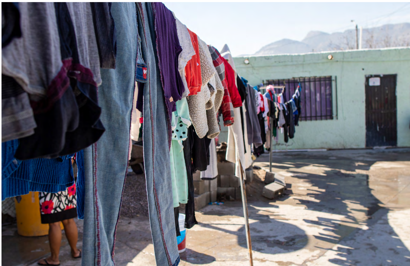
An IRC-supported shelter for asylum seekers in Juarez. Approximately 60,000 people had been stuck awaiting asylum on the border thanks to the “Migrant Protection Protocols” otherwise known as “Remain in Mexico,” leaving centres like this one overstretched and underfunded. Mexico.

asylum seekers. Over the last four years, inhumane policies and practices, such as the separation of children from family members at the US southern border under the Zero Tolerance Policy and the implementation of the Migrant Protection Protocols (MPP) greatly impacted access to territory, often forcing individuals back into harm’s way. To adequately address the increase in arrivals at US ports of entry and provide support and services for asylum seekers, the US must act swiftly in implementing safe, orderly and humane policies for asylum seekers.