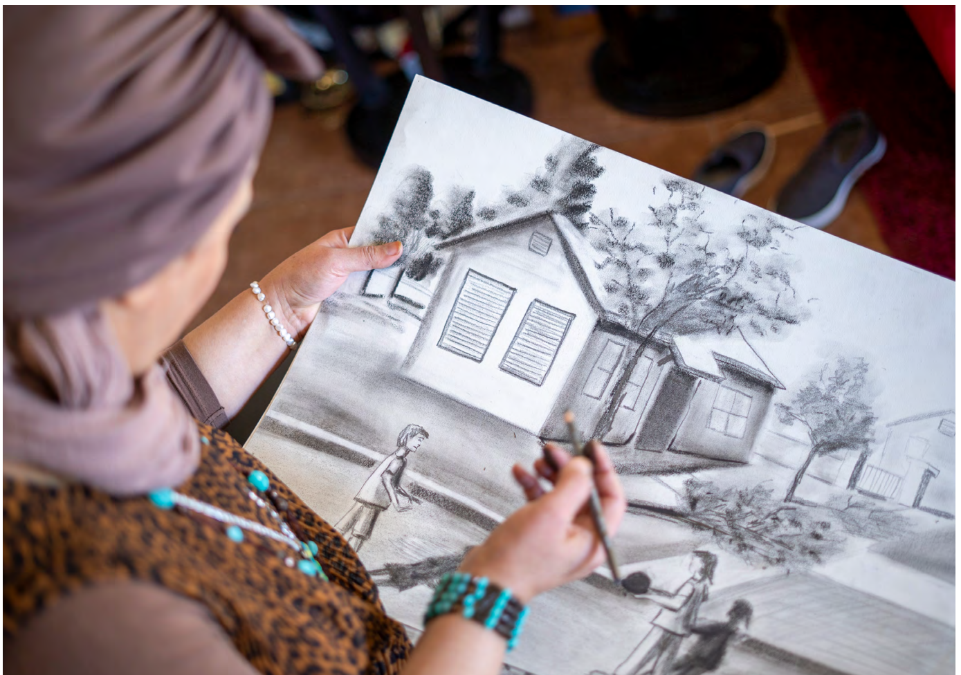
Phoenix, Arizona.