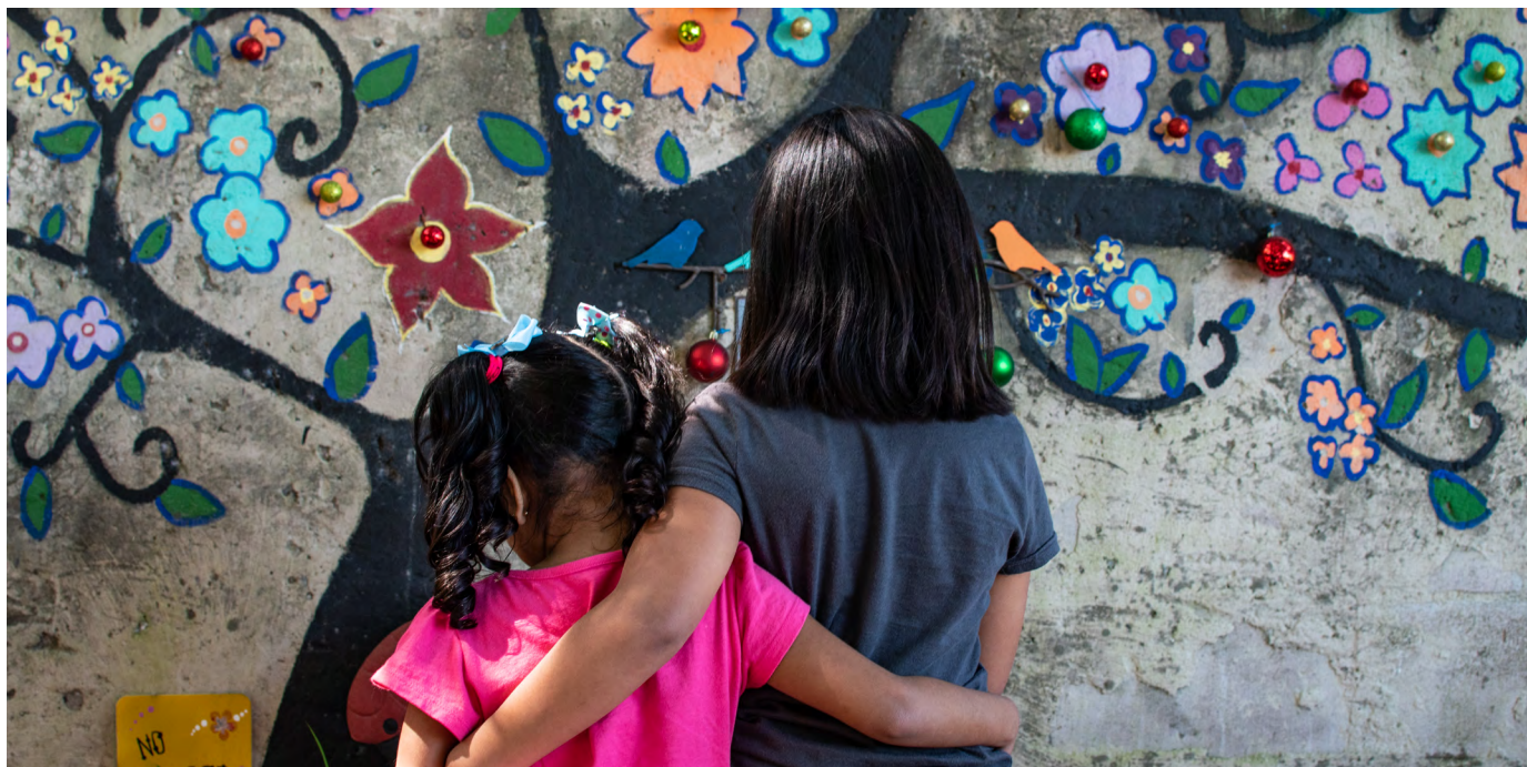
A Salvadorian family in the capital city San Salvador. The family received cash support from the IRC after being in desperate need of support. The father was running a small business when gangs tried to extort him for money. Unable to pay, the gang shot him nine times leaving him with life-long health issues. To support the family, the mother and youngest child (now 5, then 3) left to the United States. Once they crossed the border they were separated and detained for three months. Once reunited they vowed never to separate again. El Salvador.