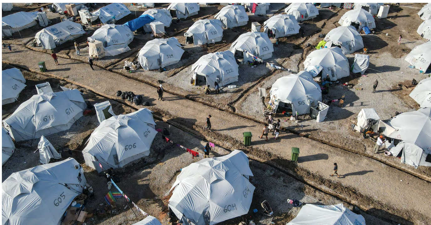
A refugee camp in Lesbos, Greece, taken in October 2020.

In the US, the protection of people seeking asylum was similarly eroded through a steady stream of regulatory and policy changes that narrowed eligibility and created insurmountable barriers for applicants, culminating in a policy of summary expulsion 55 that shut the door on all