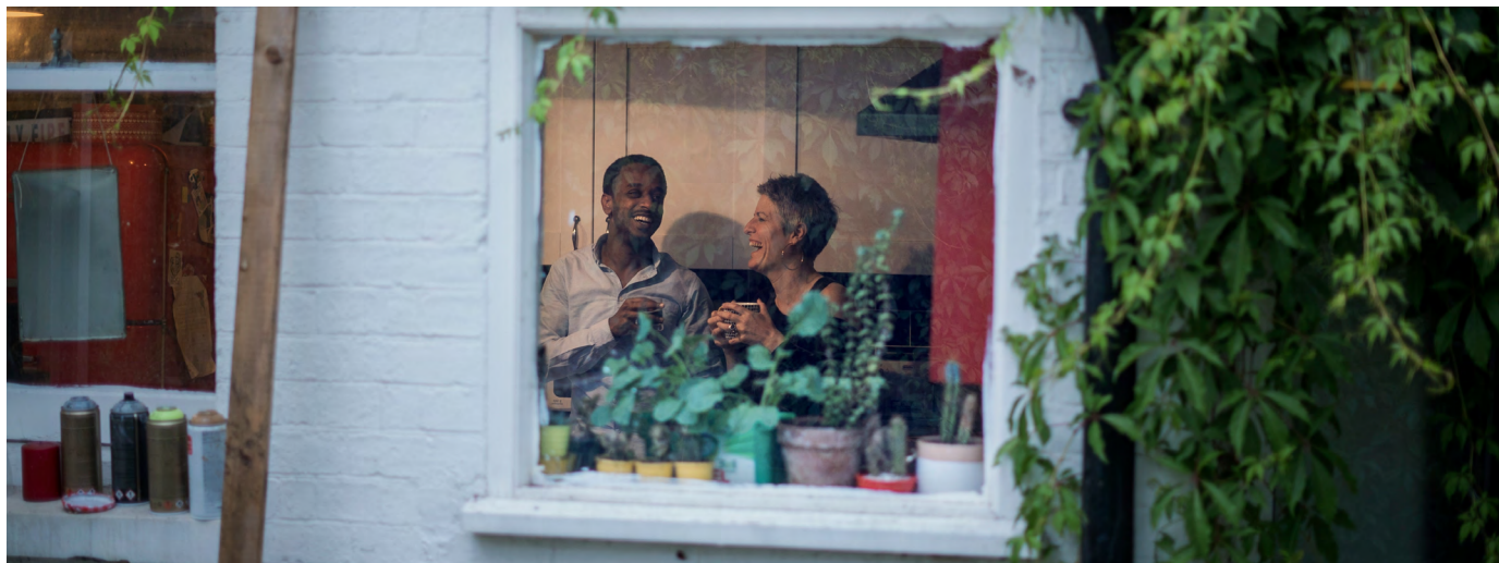
London, UK.