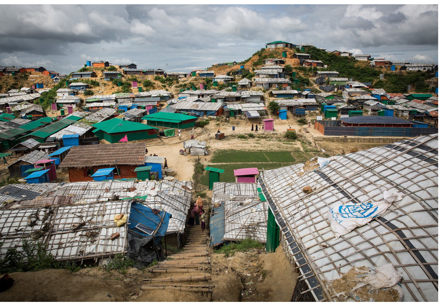
The Rohingya camps in Teknaf and Ukhiya were constructed by cutting down hills, with shelters resting on loose, sandy land.

To ensure anonymity, all data collected, sourced from internal archives, or otherwise collated was scrubbed for personal markers of refugees. In cases where names of refugees are used, they have been changed. For participants from the host community, we do not use names, but acknowledge positions of public officials in three cases. Before each interview, informed consent was obtained from all participants.