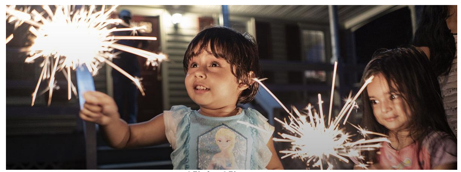
95k for 95k

As part of our advocacy efforts for the GRACE Act, the IRC is gathering the signatures of 95,000 people from across the country who support welcoming at least 95,000 refugees annually. We will share this petition with Members of Congress and the administration to demonstrate the powerful level of public support for refugees.