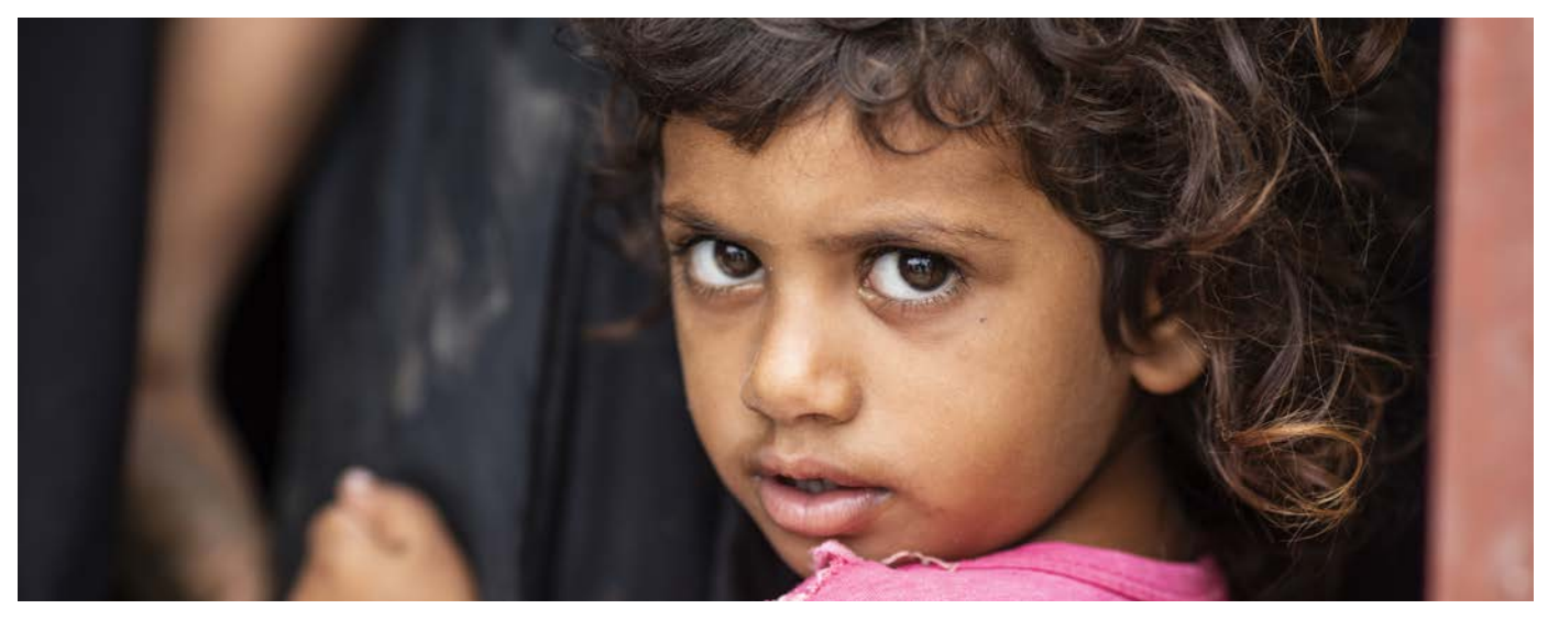
Above: A young Yemeni girl at a mobile clinic operated by the IRC on the outskirts of Aden, Yemen.

The United Arab Emirates (UAE) decision to withdraw troops, announced in July 2019, indicates an Emirati desire to extricate itself from the conflict. As recently as November 2019, the UAE's Foreign Minister Anwar Gargash said Ansar Allah "have a role in [Yemen's] future."xxv Finally, a power-sharing agreement reached between the Internationally Recognised Government (IRG) and the Southern Transitional Council (STC) addresses a key split within the anti-Ansar Allah alliance, and while imperfect, the deal should help stabilise southern Yemen, and creates the possibility of more inclusive peace talks by including representatives of the STC in the IRG's peace talk delegation. It is now vital that robust diplomacy and international support focuses on ensuring the agreement delivers on its potential to secure new, ambitious nationwide talks.