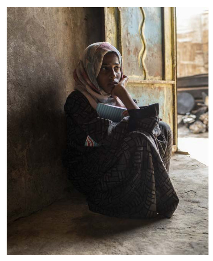
Above: A young student at a home on the outskirts of Aden, Yemen.

The international community has generously supported the humanitarian response, investing a total of $8.3 billion into successive humanitarian appeals, delivering life-saving healthcare and nutritional support, food aid, and water to millions of Yemenis. In 2018, the same year famine conditions