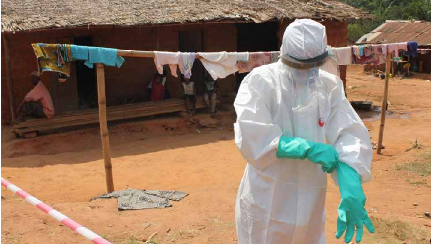
An ambulance nurse in Kono, Sierra Leone, preparing to help a child into an ambulance.

significant portion of foreign investment, a review on their value for money should also be conducted.