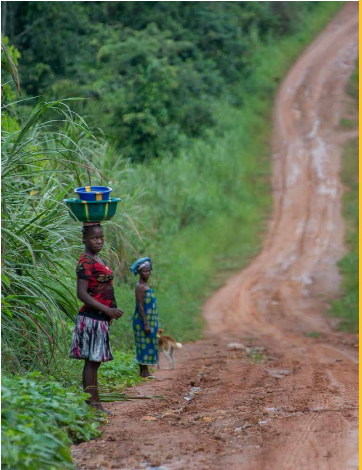
Road to Foya, where the Ebola virus first crossed into Liberia from Guinea, October 2014.